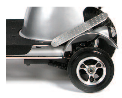
Quintell™Adaptive Footplates Adjustable to match your measurements