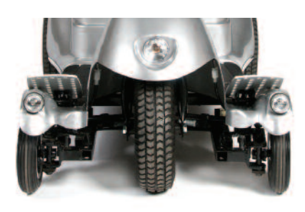
Quintell™Self Centering Steering Defaults to straight travel with minimal effort