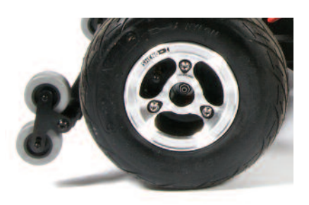
Quintell™Kerbmaster™ Anti-tipping / Powered Anti-grounding