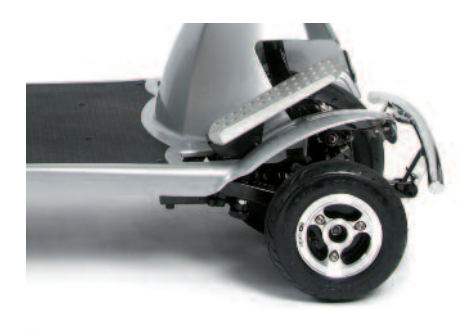
Quintell™Adaptive Footplates Adjustable to match your measurements