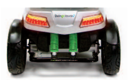
SmoothDrive II Suspension + LED lights Smoother,safer journeys with high intensity front and rear, hazards and brake lights