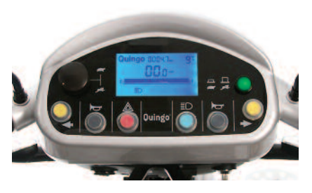
Multi-feature digital dash/LCD display Easy to read layout and controls