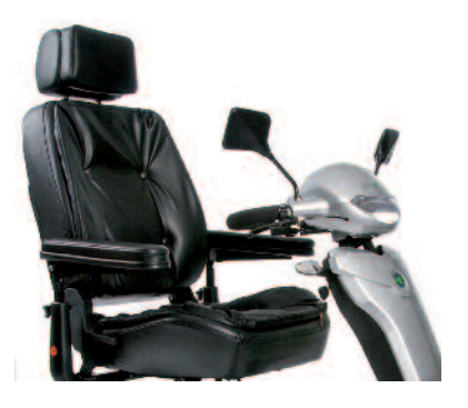
Super Lux Double Padded Seat Extra wide, Extra high back Reclining seat with Adjustable Armrests and Headrest