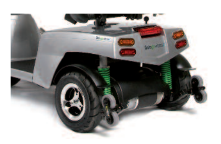
Long Travel Suspension & Kerbmaster Anti-grounding & Anti-tipping Smoother and safer journeys with style