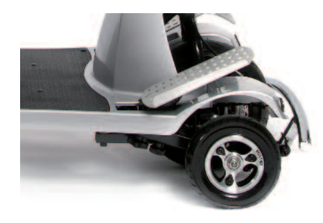
Quintell™Adaptive Footplates Adjustable to match your measurements