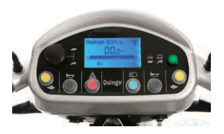
Multi-feature digital dash/LCD display Easy to read layout and controls