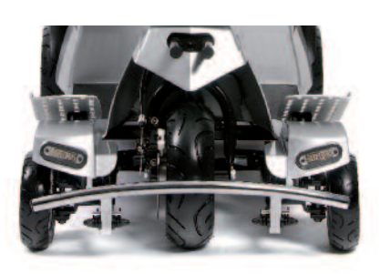
Quintell "Self Centering Steering Defaults to straight travel with minimal effort