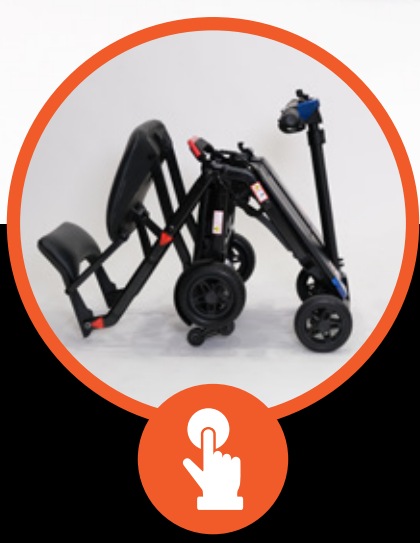
REMOTE CONTROL AUTOMATIC FOLDING