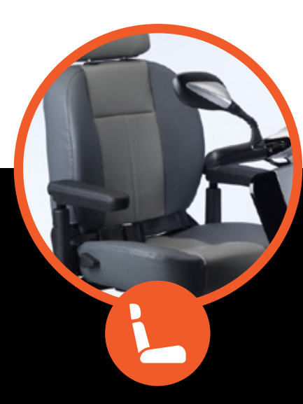
BREATHABLE CONTOURED SEAT