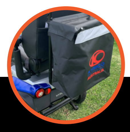
KYMCO REAR SHOPPING BAG