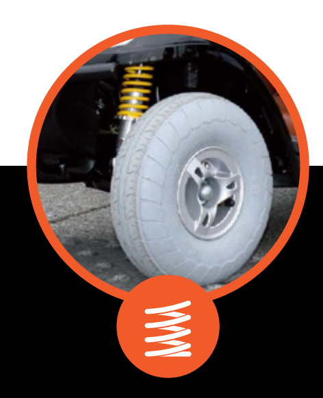
FULLY ADJUSTABLE SUSPENSION