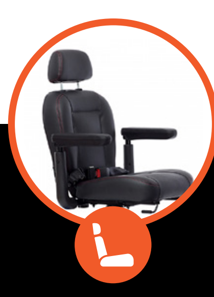
BREATHABLE CONTOURED SEAT