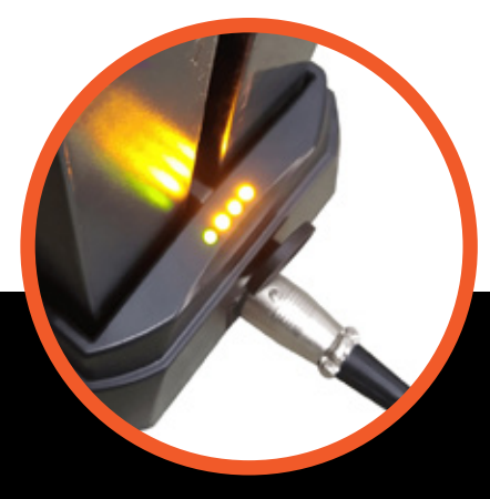
BATTERY DOCKING STATION