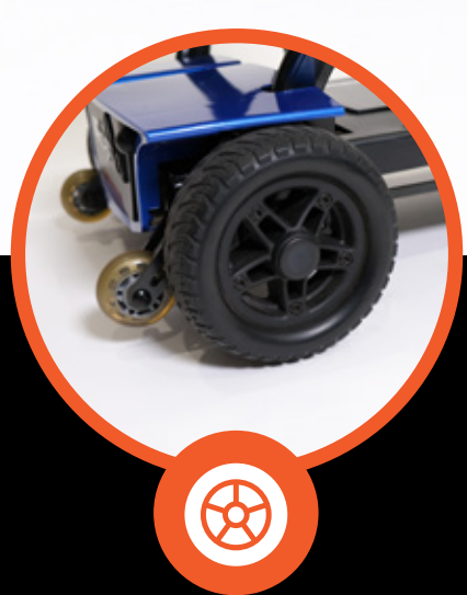
PUNCTURE PROOF TYRES