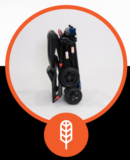
LIGHTWEIGHT COMPACT DESIGN