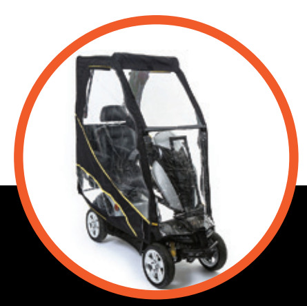
SCOOTERPAC ALL-WEATHER CANOPY