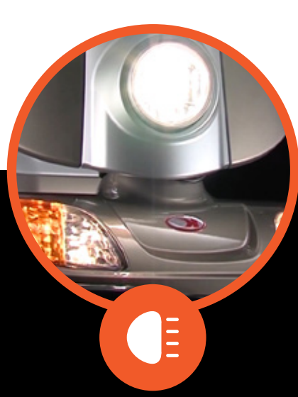
FRONT AND REAR LIGHTING