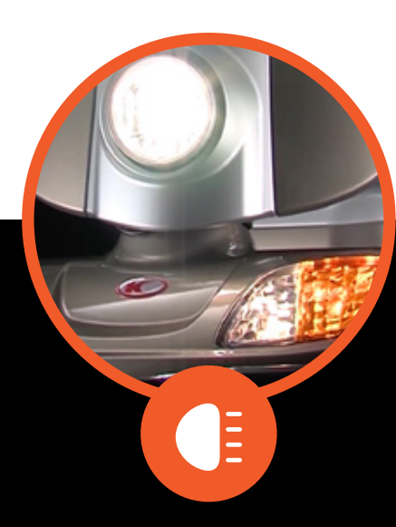
FRONT AND REAR LIGHTING