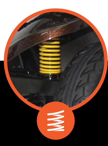
FRONT & REAR SUSPENSION