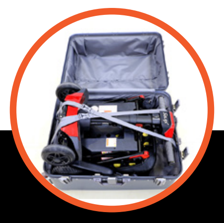
LOCKABLE HARD CASE