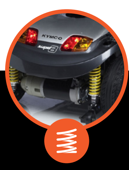
FULLY ADJUSTABLE SUSPENSION