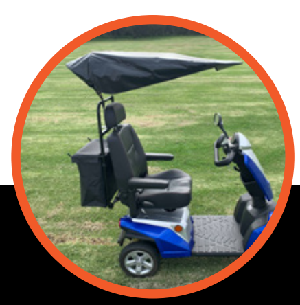
KYMCO SUN CANOPY