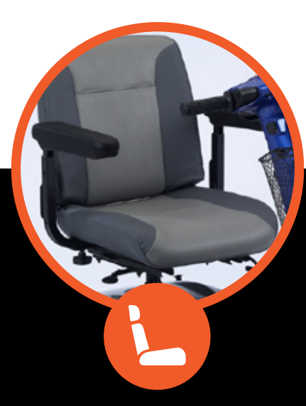
ADJUSTABLE CAPTAIN STYLE SEAT