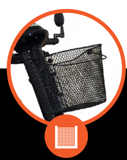
FRONT BASKET INCLUDED