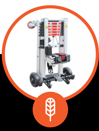
LIGHTWEIGHT COMPACT DESIGN