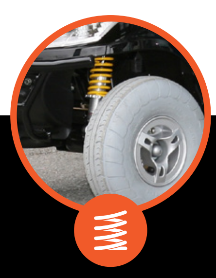
FULLY ADJUSTABLE SUSPENSION