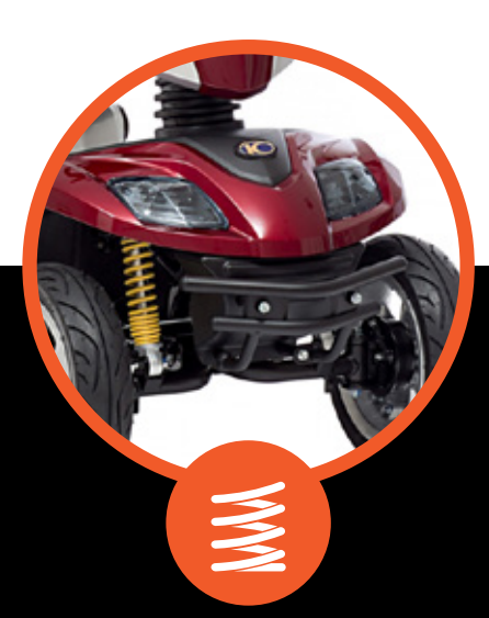
FULLY ADJUSTABLE SUSPENSION