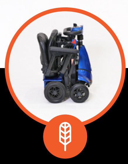
LIGHTWEIGHT COMPACT DESIGN