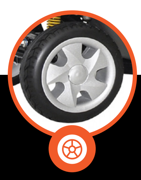
PUNCTURE PROOF TYRES