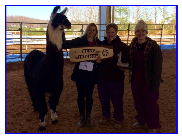
Continued on page 8