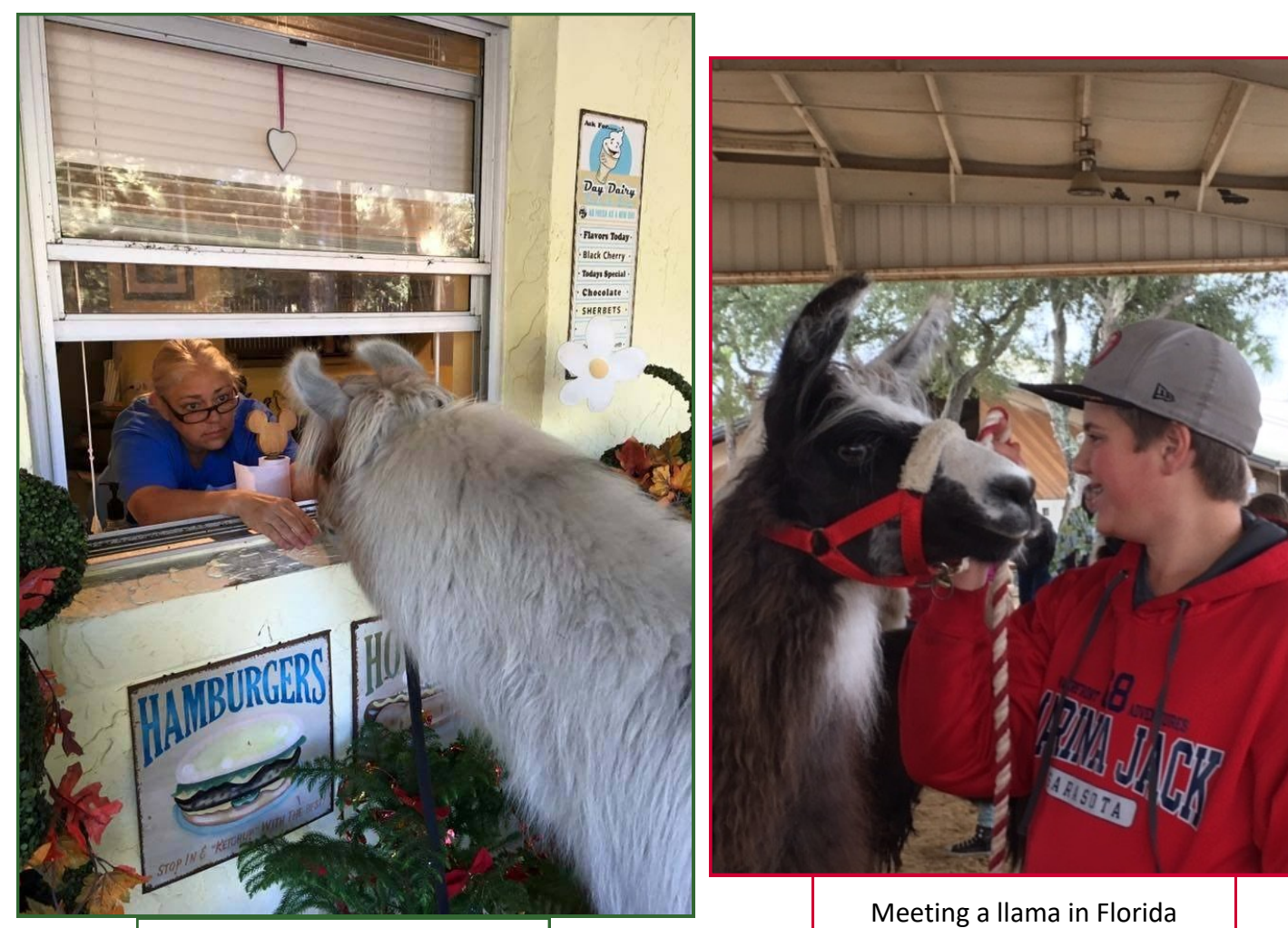
Would you like fries with that?