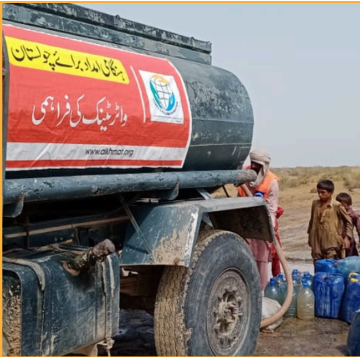
Serving Communities in challenging times