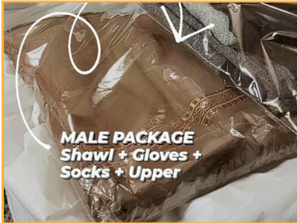
Water Storage Tank at Govt High School Chakshadi