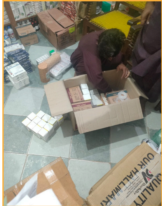
Volunteers preparing medical supply packages for delivery