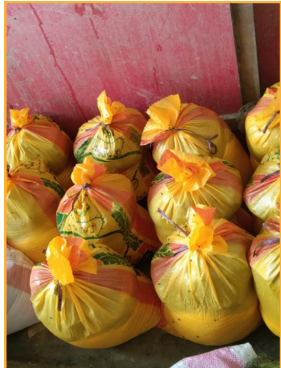
Relief packages ready for distribution