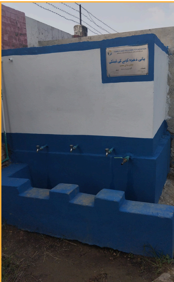
Water Storage Tank at Govt Middle School Chak Jani