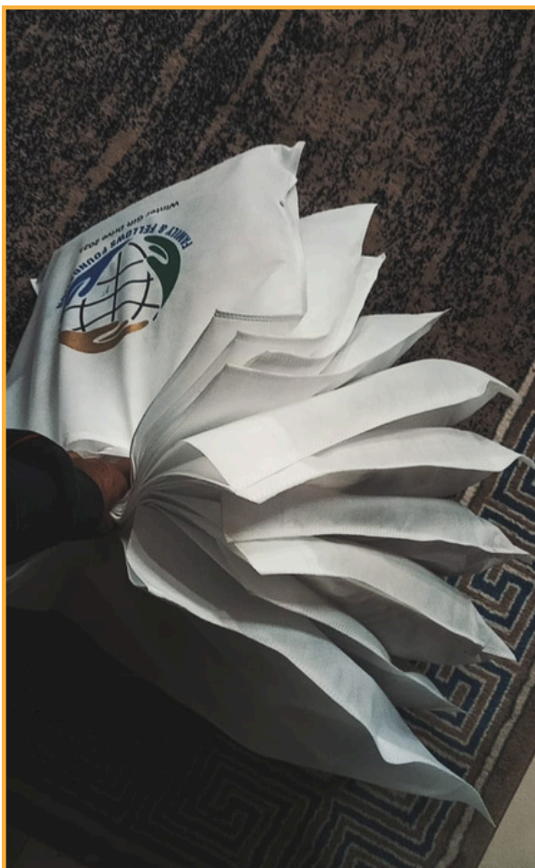
Volunteers going out for distribution of Winter Clothing