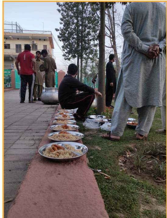
Plates ready for distribution