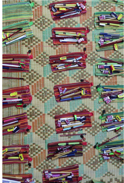
Packages are being prepared