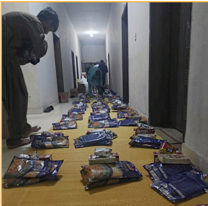
Volunteers preparing Eid packages