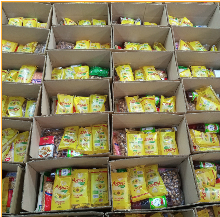
Volunteers are preparing ration packages for delivery