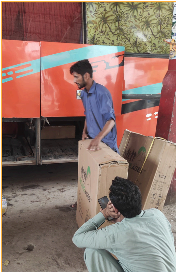
Volunteers loading Wheel Chairs for Transportation from Rawal Pindi to Doulat Pur