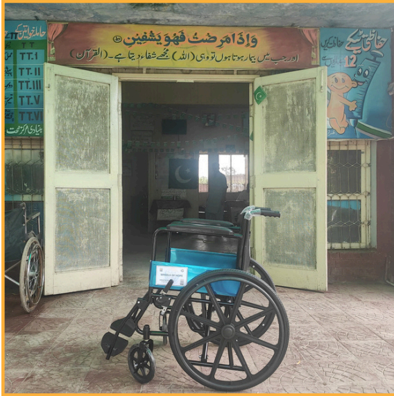
Wheel Chair donated to BHU Pindi Said Pur