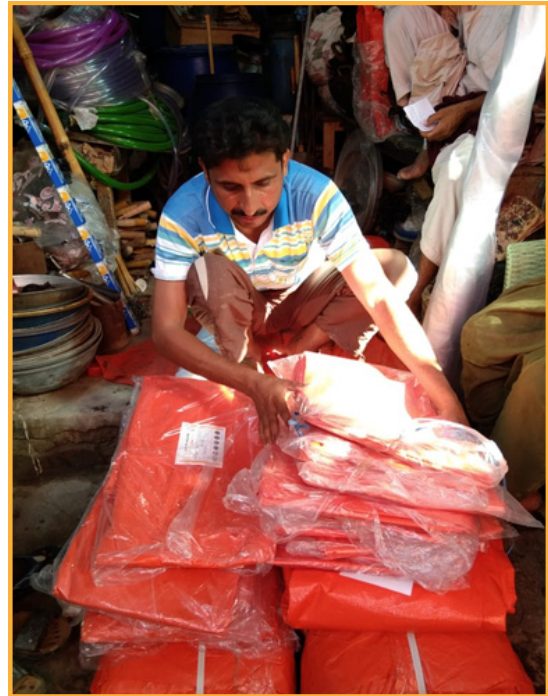
Volunteers preparing packages for delivery to flood victims