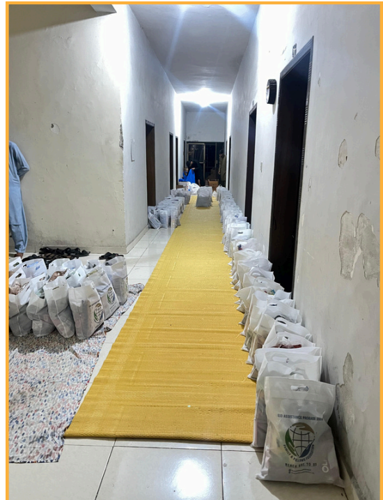
Packages ready for distribution