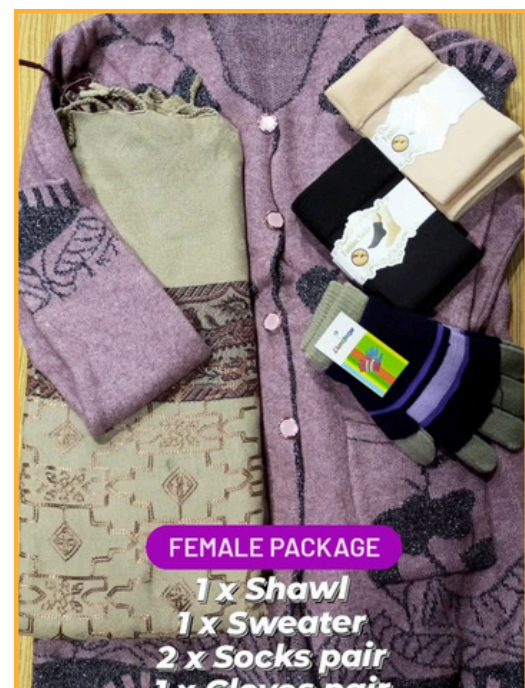
Contents of Adult Package