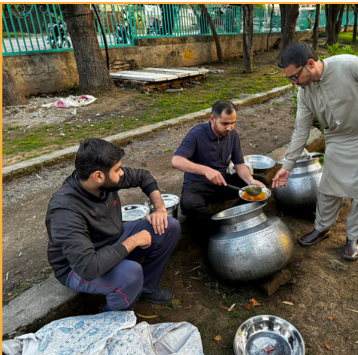
Vounteers are serving food at Ramadan Dastarkhawn