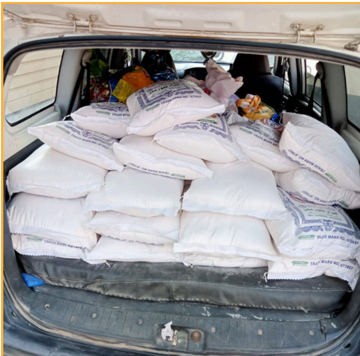
Volunteers ready for door to door distribution