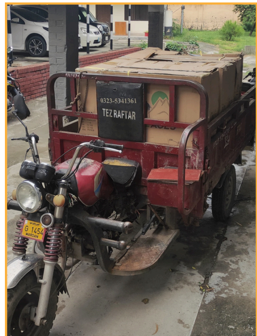
Wheel Chairs loaded for delivery to recipients