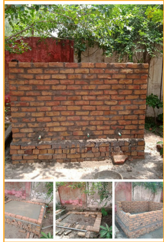
Construction In Progress at Govt High School Chakshadi