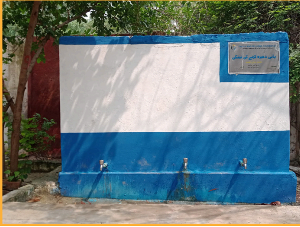
Water Storage Tank at Govt High School Chakshadi