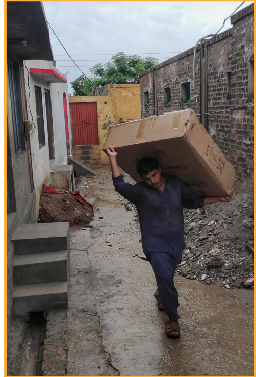
Vounteers going door to door to deliver wheel chairs