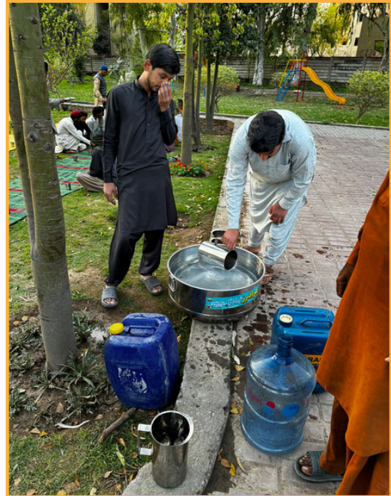
Vounteers preparing Juice for serving in Aftar