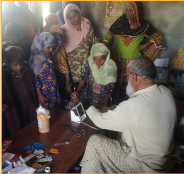
Medical Camp established for check up and delivery of medicines