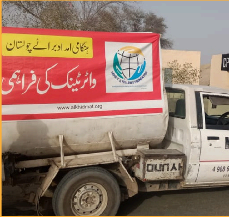
Water Bowsers leaving for Cholistan Desert