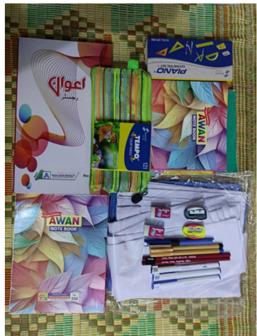
Contents of 1 Package