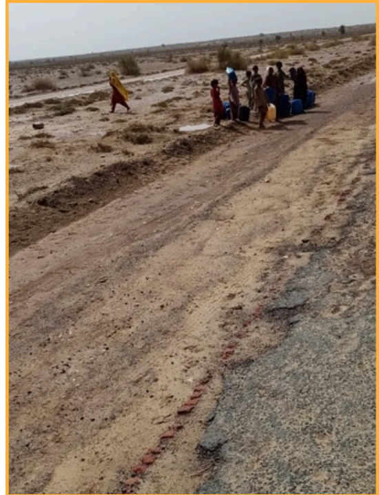
Residents awaiting water delivery