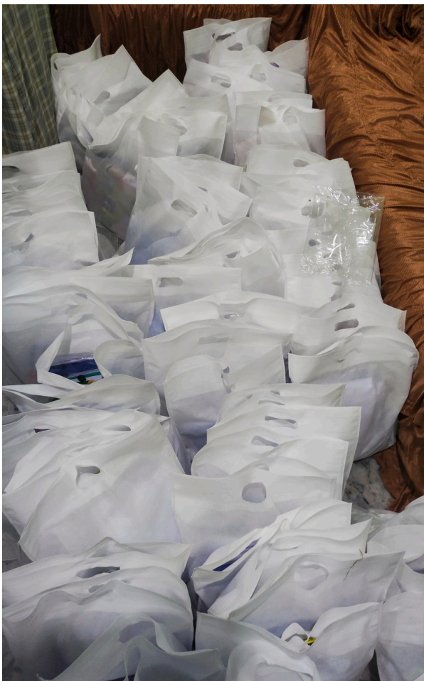
Packages are ready for distribution