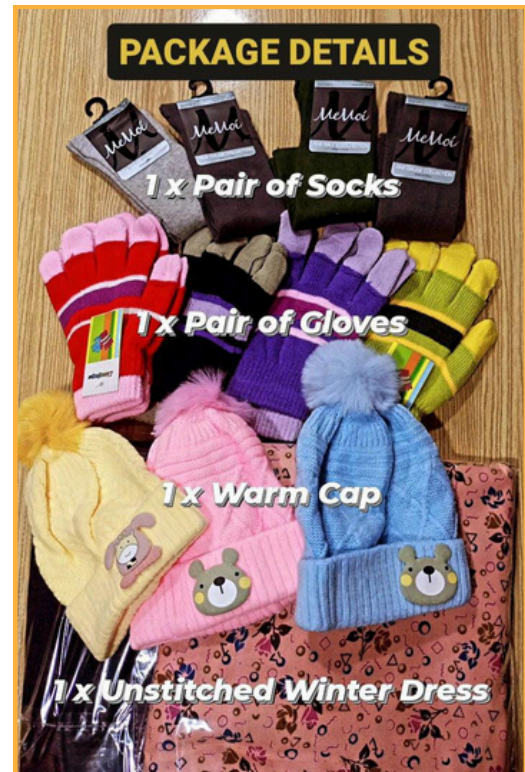
Contents of Kids Package