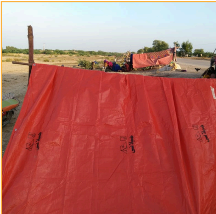
Temporary shelters being established for flood victims