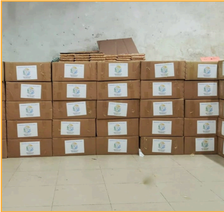
Ration packages are being prepared