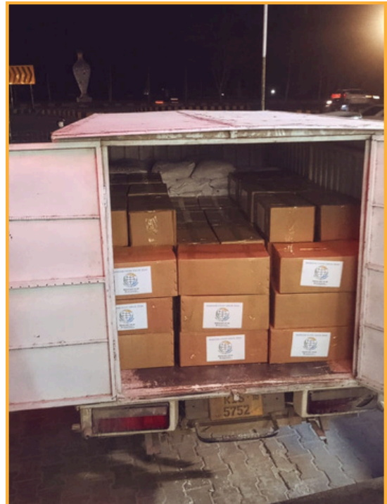
Volunteers leaving for delivery of ration packages in cover of night