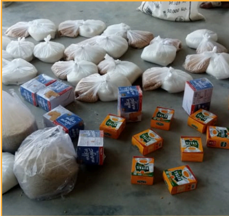
Preparation of Ration packages for distribution