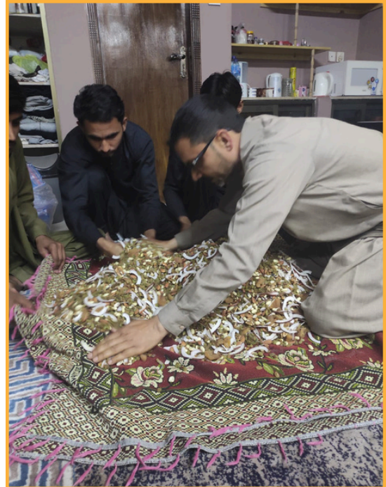
Volunteers preparing Dry Fruits packages