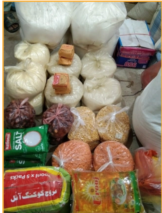
Volunteers preparing ration relief packages