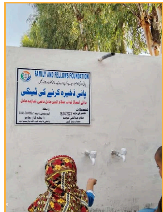
Water Storage Tank at Govt Primary School Abdul Ghani Khosa (Baluchistan)