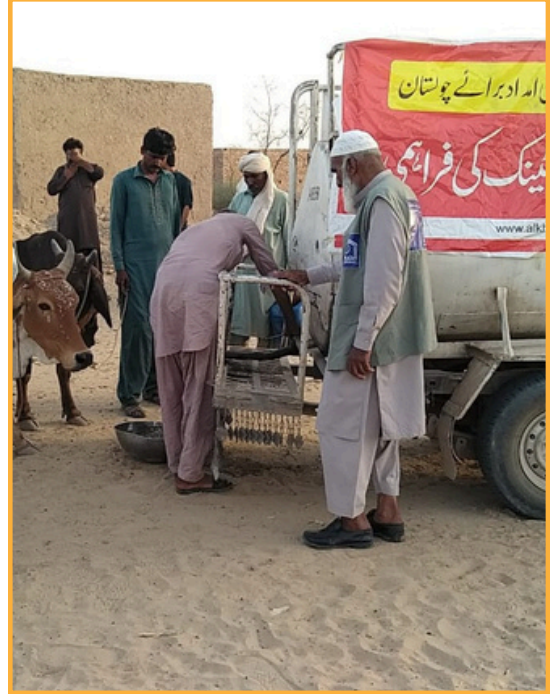
Volunteers serving communities