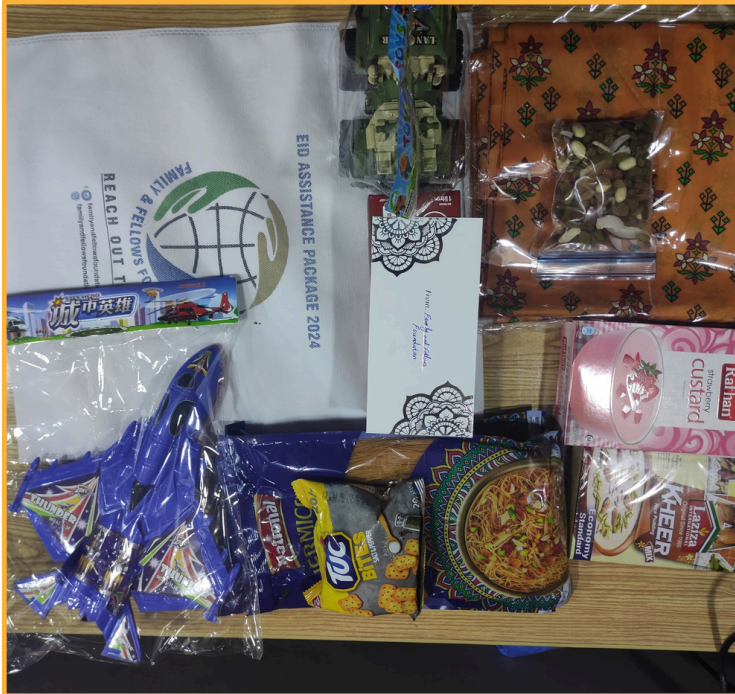
Contents of 1 Eid assistance package