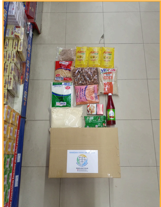
Contents of 1 ration package