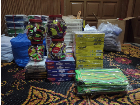
Sorting for Preparation of Packages