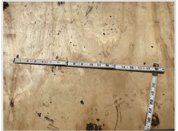
8d Ringshank Renail, nails within 6"