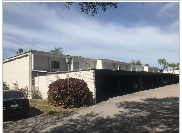
1851 - 1869 Pine Cone Cir (Rear)