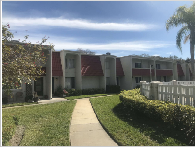
1851 - 1869 Pine Cone Cir 33760