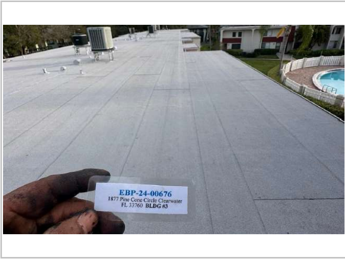
Mod Bit Roofing