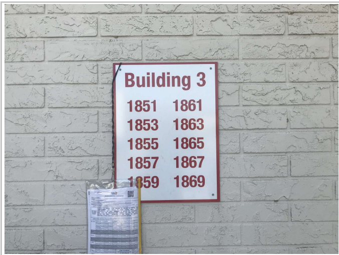
1851 - 1869 Pine Cone Cir 33760