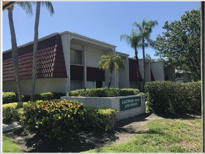
1871 - 1877 Pine Cone Cir 33760