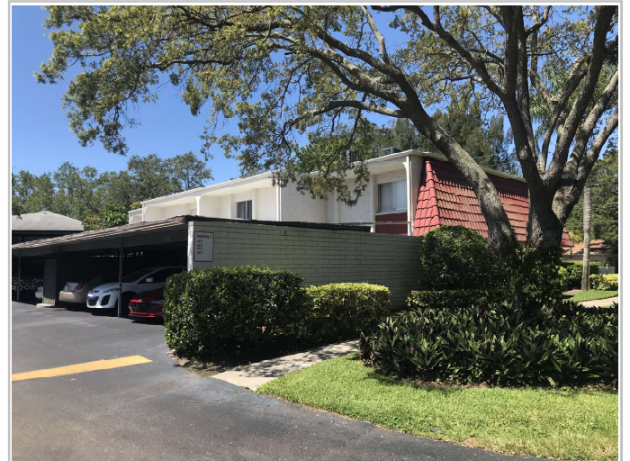
1871 - 1877 Pine Cone Cir