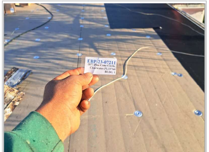
8d Ringshank Renail, nails within 6"