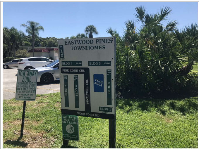
1871 - 1877 Pine Cone Cir