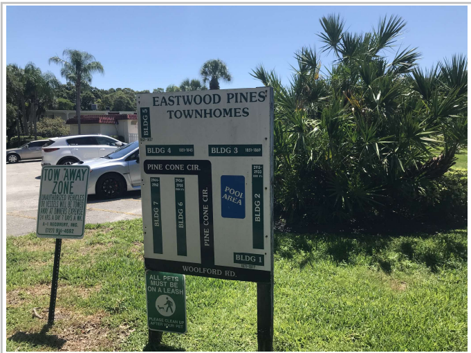
Pine Cone Cir (Pool House)