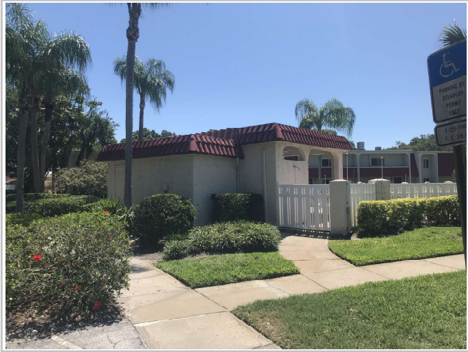
Pine Cone Cir (Pool House) 33760