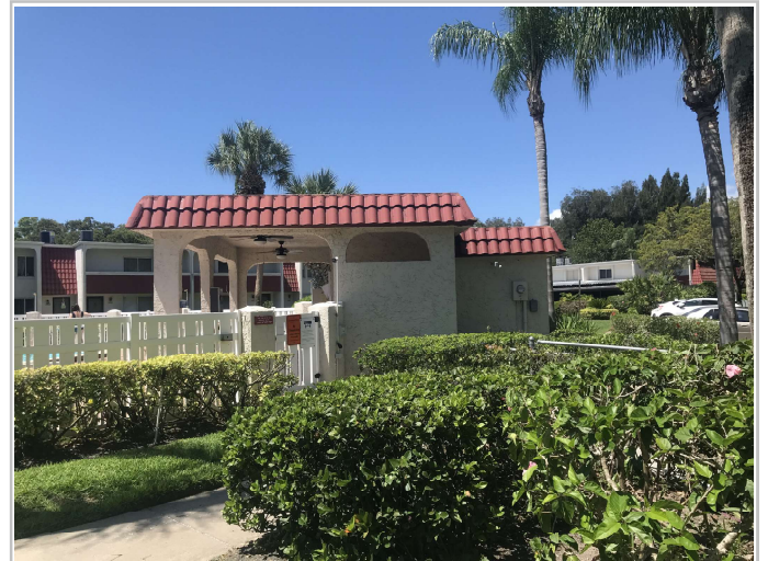
Pine Cone Cir (Pool House)