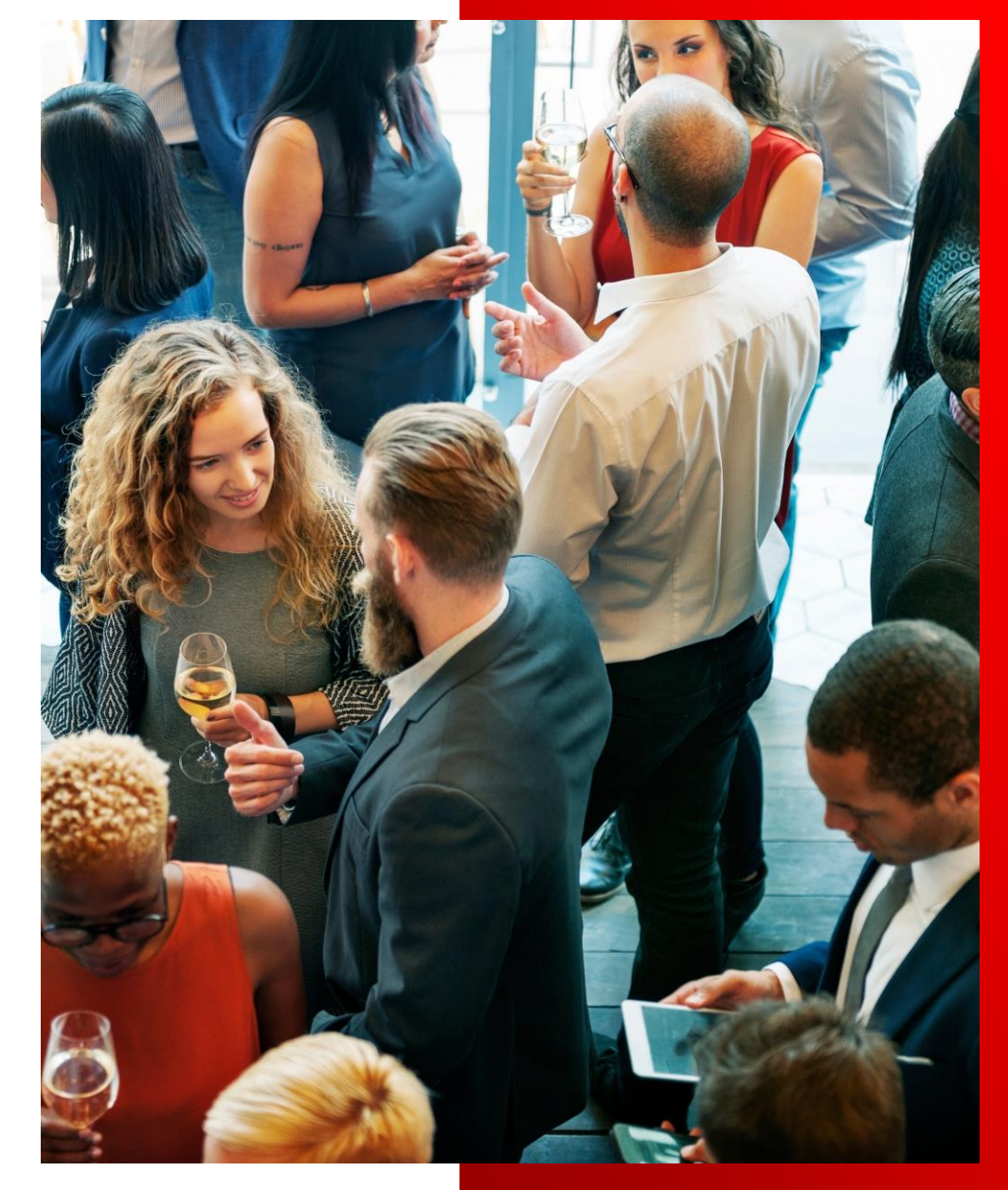
*Times subject to change