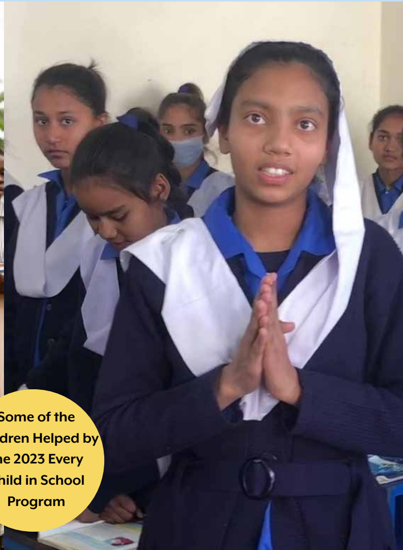
Some of the Children Helped by the 2023 Every Child in School Program