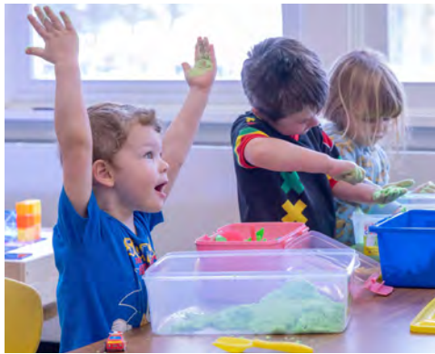
Children play in the Ticonderoga Community Early Learning Center