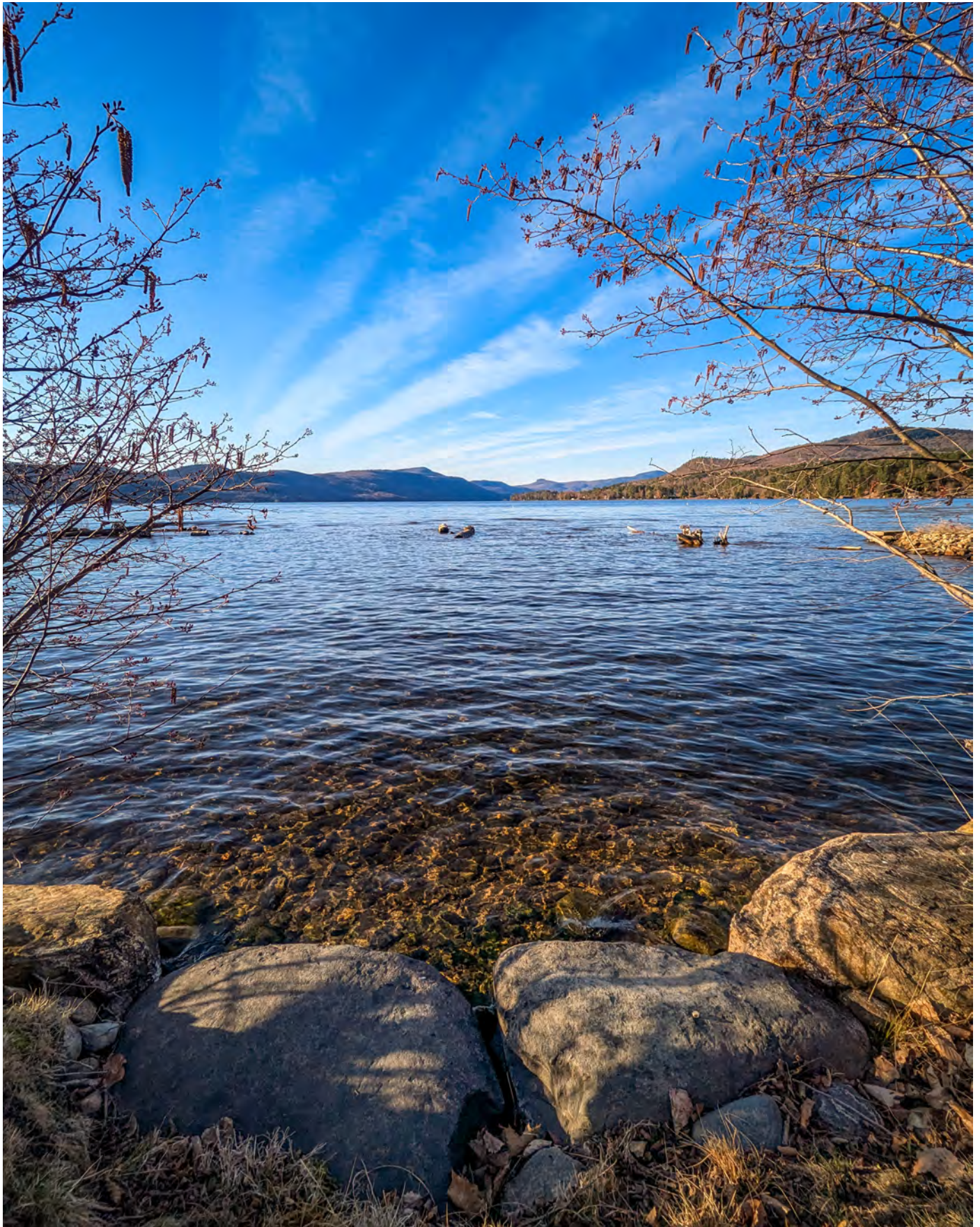
Photo taken from Peggy's Point