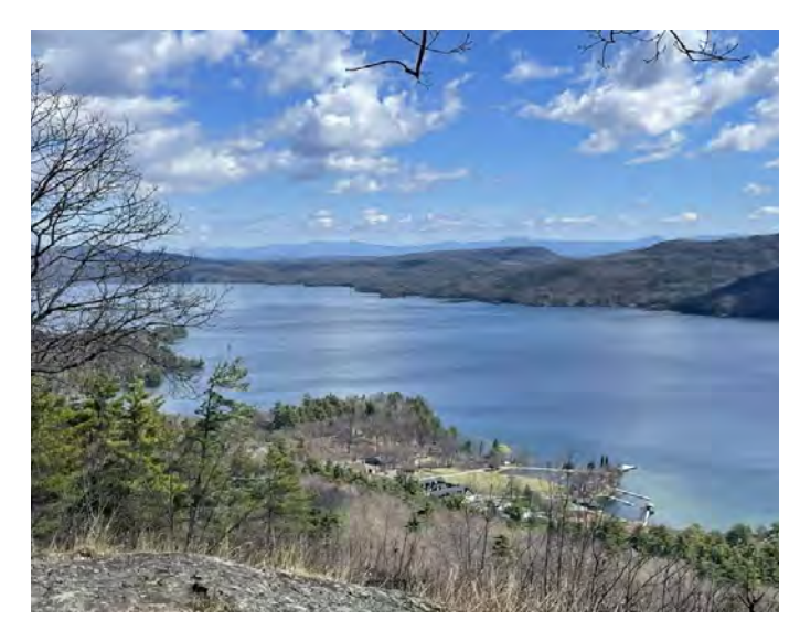
April view of the northern basin.

To learn more about the Silver Bay YMCA Ticonderoga Teen Center follow them on Facebook and Instagram or visit <u>silverbay.org</u>.