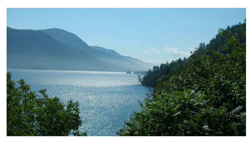
THE overlook - the view we can't wait to see every year!