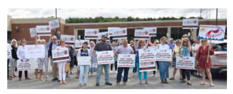
Opponents of ProcellaCOR outside the courthouse

spring of 2024. The LGPC applied for new permits, and the APA approved those permits on June 20, 2024, followed quickly by DEC approval.