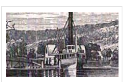
THE JOHN JAY