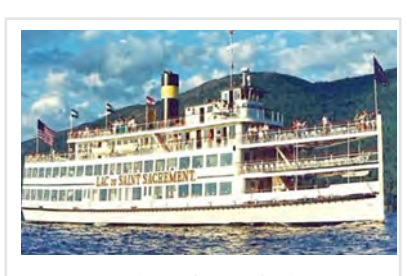
THE LAC DU SAINT SACREMENT

The Ticonderoga I was the last large ship built on Lake George. It was launched in 1884 and operated until 1901, when it was destroyed by fire.