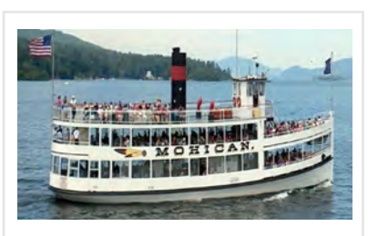
THE MOHICAN II