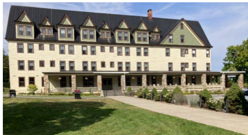
TOP AND MIDDLE ROW: tornado aftermath; BOTTOM ROW: The inn October 2024.