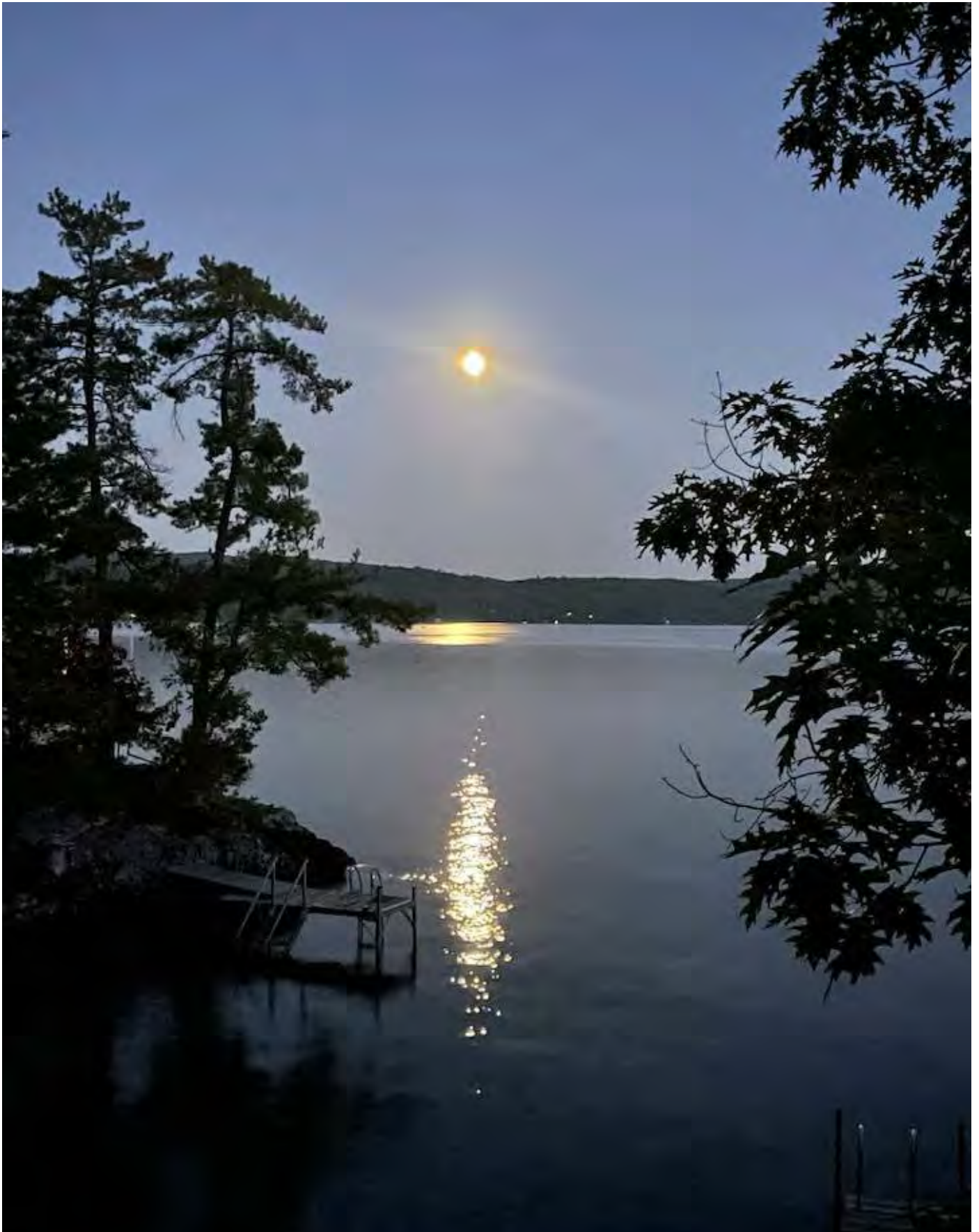
Moon rising on September 16, 2024.