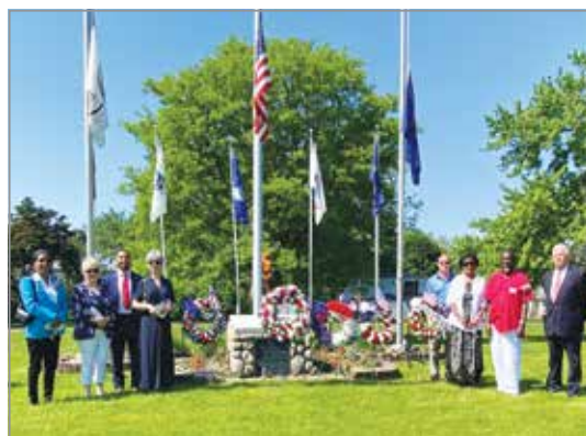
Memorial Day Ceremony