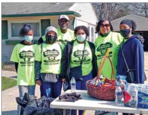
Earth Day Clean-Up