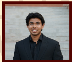
Omran Momen Security Council (SC) Co-Chair