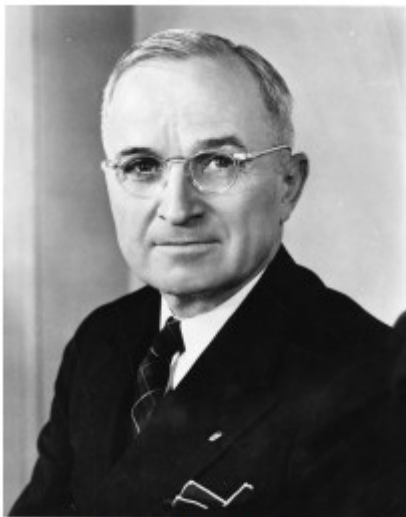
Harry S. Truman, 33rd U.S. President

You're here to be light, bringing out the God-colors in the world. God is not a secret to be kept. We're going public with this, as public as a city on a hill. If I make you light-bearers, you don't think I'm going to hide you under a bucket, do you? I'm putting you on a light stand. Now that I've put you there on a hilltop, on a light stand—shine! — Matthew 5:14-15