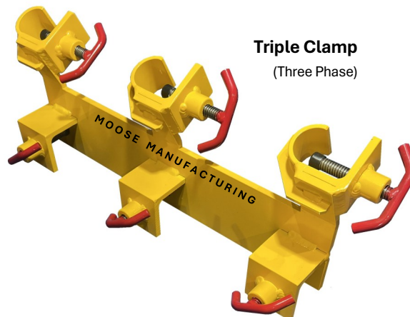
Triple Clamp (Three Phase)