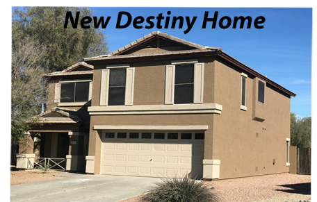
New Destiny Home