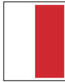
Half Page (vertical)