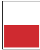
Half Page (horizontal)