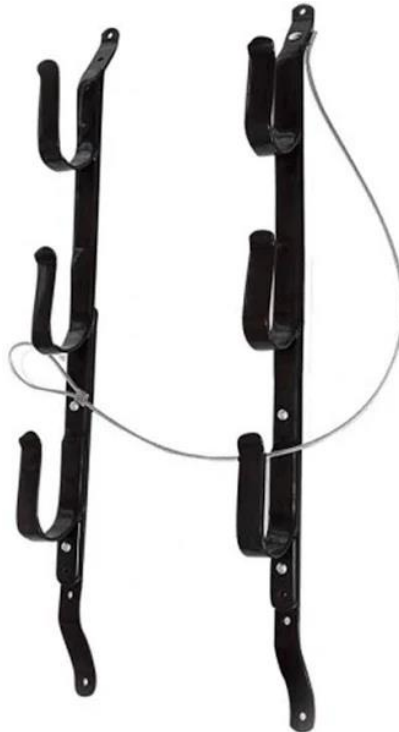
Lockable Gun Rack