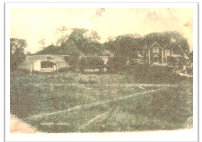
OLD BRIDGE SHOWING DRY ARCH ON LEFT

Costs, however, had risen substantially and shareholders were somewhat more than reluctant to invest further. A further £2500 was needed to complete the remaining three miles from Alderbury and could not be found. In 1803-04 the canal company continued to try to raise money, including widely advertising the availability of the open part of the canal, but usage instead tailed off and by 1808-10 had ceased. The canal gradually faded away, some areas became dry, local people reclaimed their lands, pulled down the locks and found other uses for the bricks and stone used in construction.