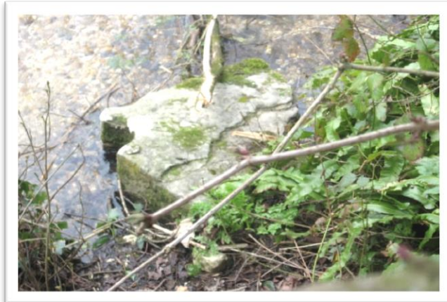
CANAL STONE IN THE RIVER TODAY

This board has been placed where this canal once ran. The Act of Parliament authorising construction of the canal was passed in May 1785. There was already a canal from Andover to