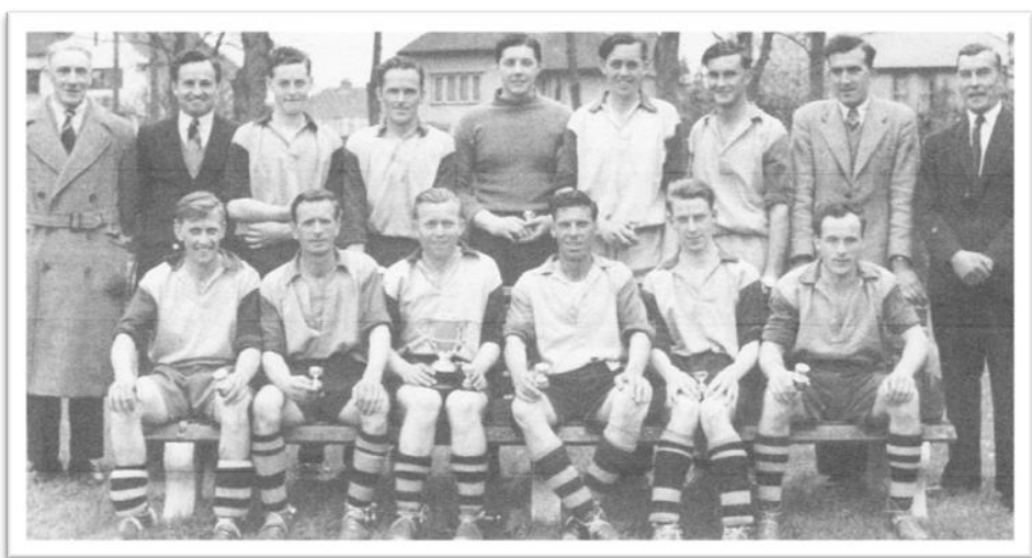
WEST DEAN FOOTBALL TEAM 1956-57

During the Second World War both clubs suspended their activities. This was initially because so many of their players were serving in the forces that they could not put a team together. Later in the war the field in which the Hut stood, which belonged to the Rectory but was generally known as The Park and had provided the pitches for both clubs, was taken over by the American forces and a camp of Nissen huts and wooden-framed asbestos buildings constructed on it. After the end of the war some of these buildings were sold off and at least one survives in the village today as a garden shed.