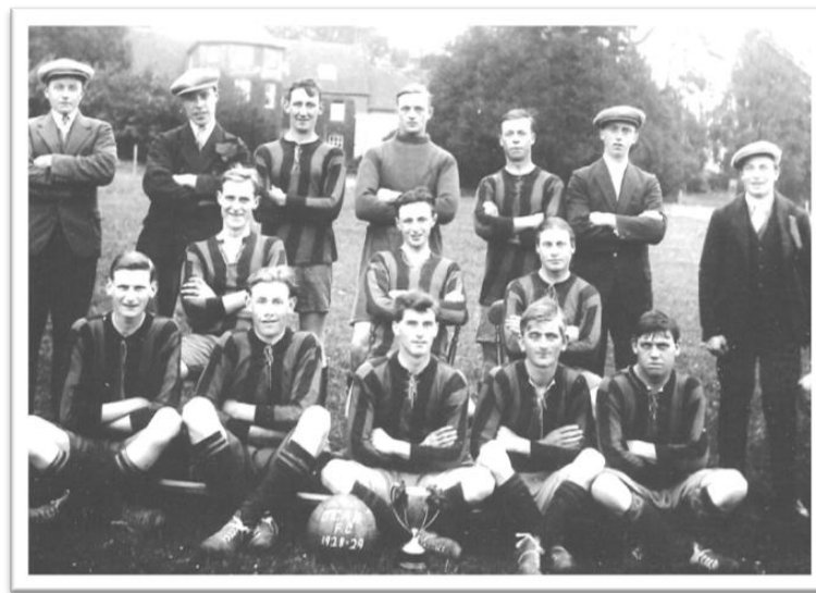
WEST DEAN FOOTBALL TEAM 1928-29

In 1938 the Cricket Club decided that the Hut was in need of repairing and repainting to which end the club spent £3 on materials and its members volunteered and did the work. Some of the teams who used the "Hut":