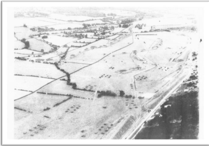
VIEW OF SITE WHILE UNDER CONSTRUCTION (NOW DEAN HILL PARK)

In 1938, with the threat of war looming, the Admiralty requisitioned over 500 acres of land in West and East Dean and work began on the Depot. Over three years teams of Irish miners and Scottish fitters, aided by local labourers, tunnelled 24 storage magazines up to 71 metres in depth into the chalk of Dean Hill and over the rest of the site built some 150 buildings including workshops and laboratories.