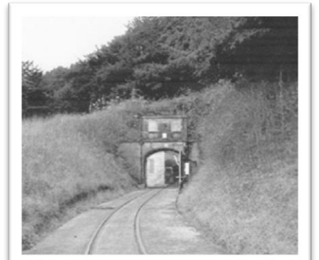
ENTRANCE TO ONE OF THE STORAGE MAGAZINES