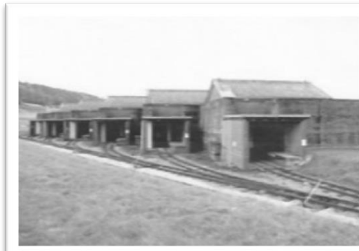
THE SIX LIGHT LABORATORIES