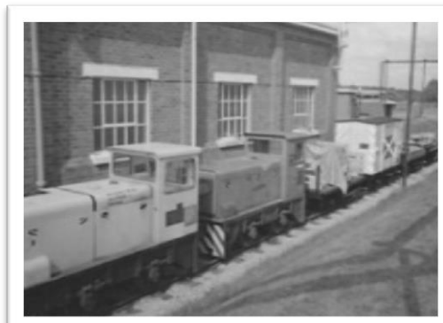
THE NARROW-GAUGE RAILWAY IN ACTION