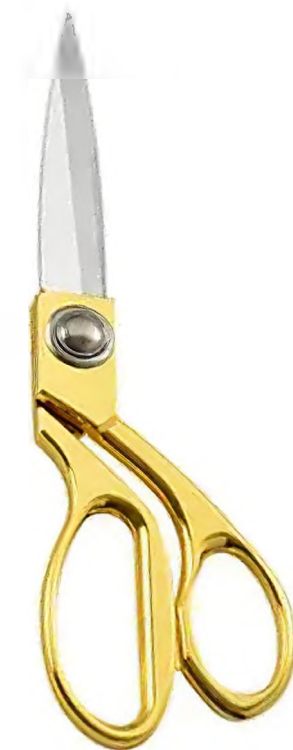
HZTS001-S 8 INCH 200 MM