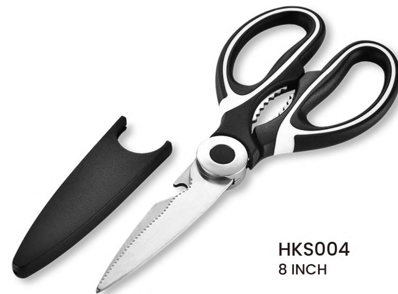
HKS004 8 INCH

*Low-cost & on-stock products, undetachable.