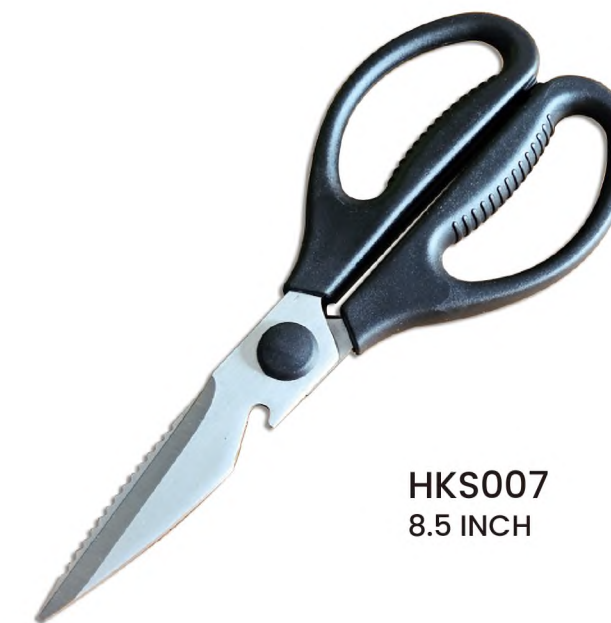
HKS007 8.5 INCH

*Regular blade. Half cost as CNC blade, detachable and multifunctional.