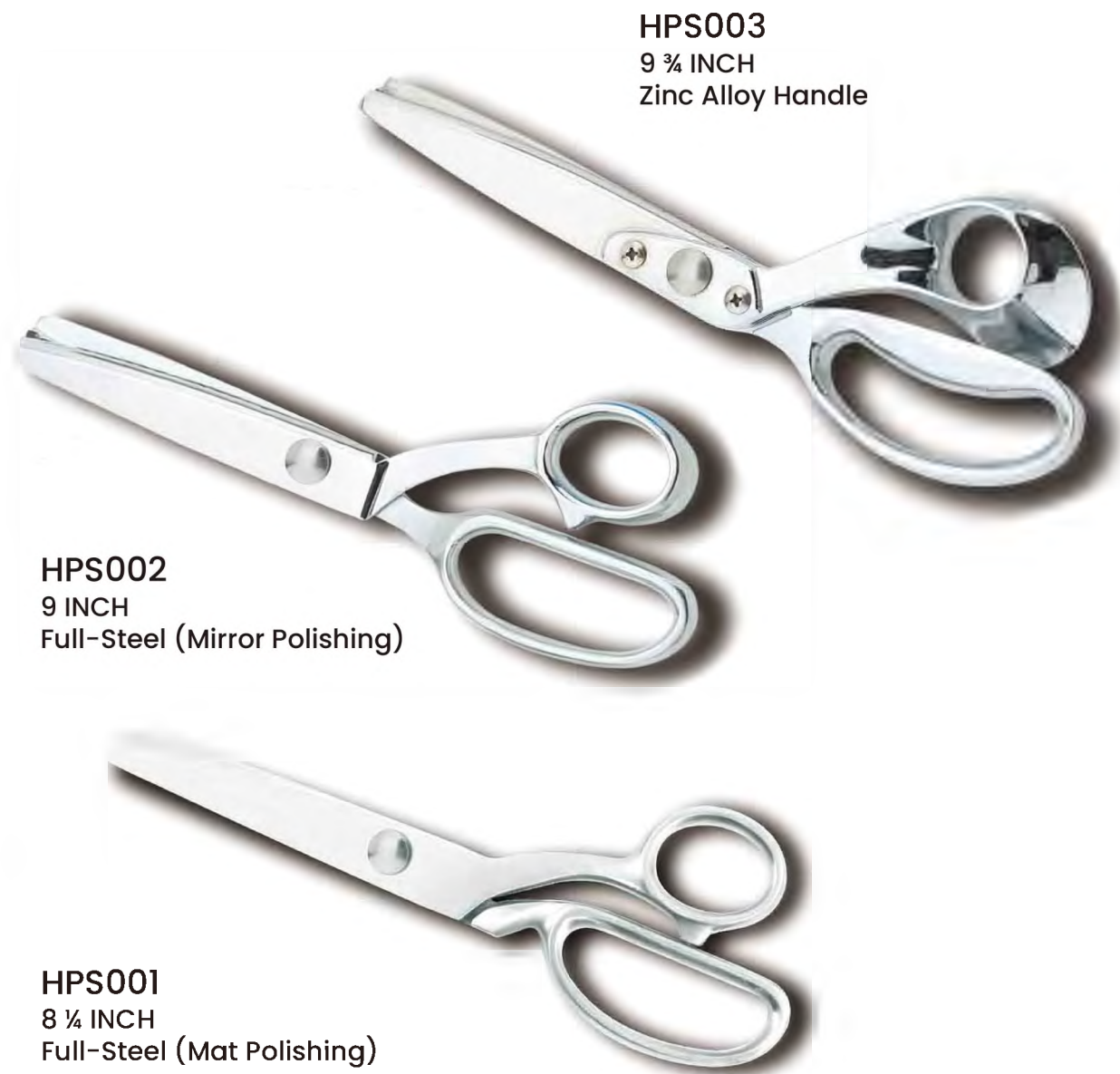
HPS002 9 INCH Full-Steel (Mirror Polishing)