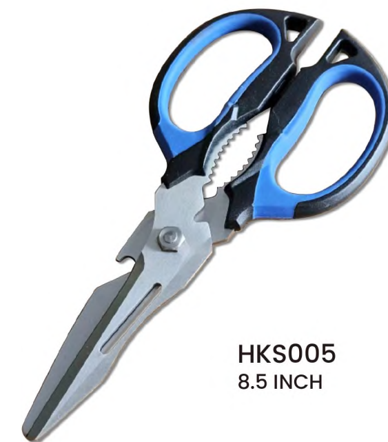
HKS005 8.5 INCH

*Low-cost & on-stock products, undetachable.