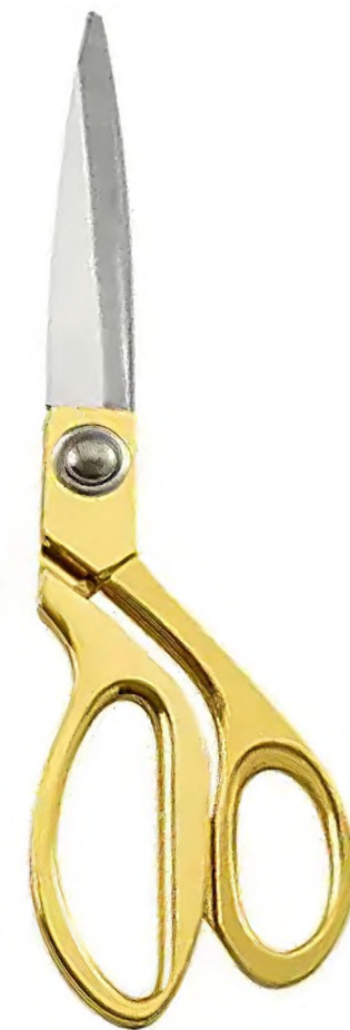
HZTS001-M 9 ½ INCH 240 MM