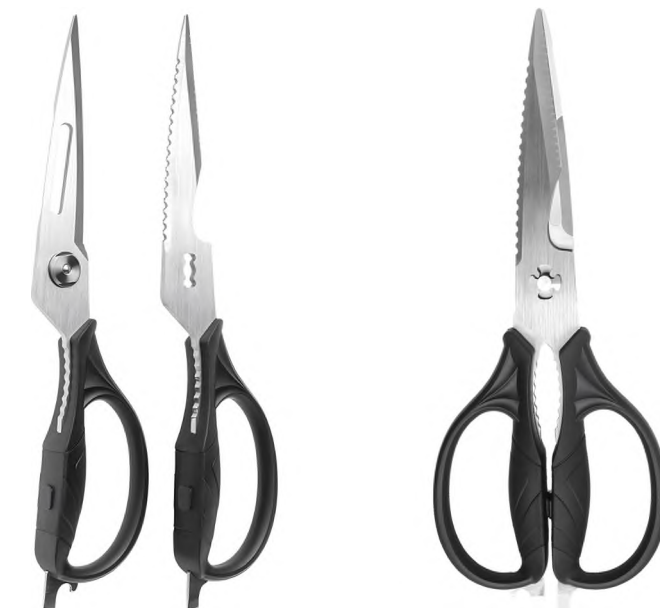
HKS001 9 INCH 230MM