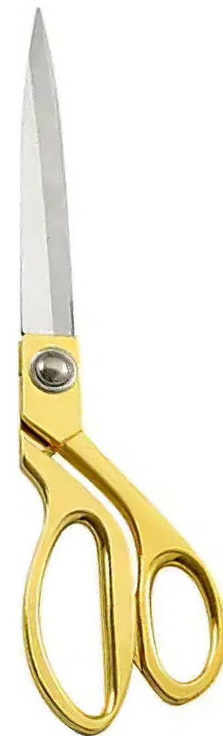
HZTS001-L 10 ½ INCH 265 MM