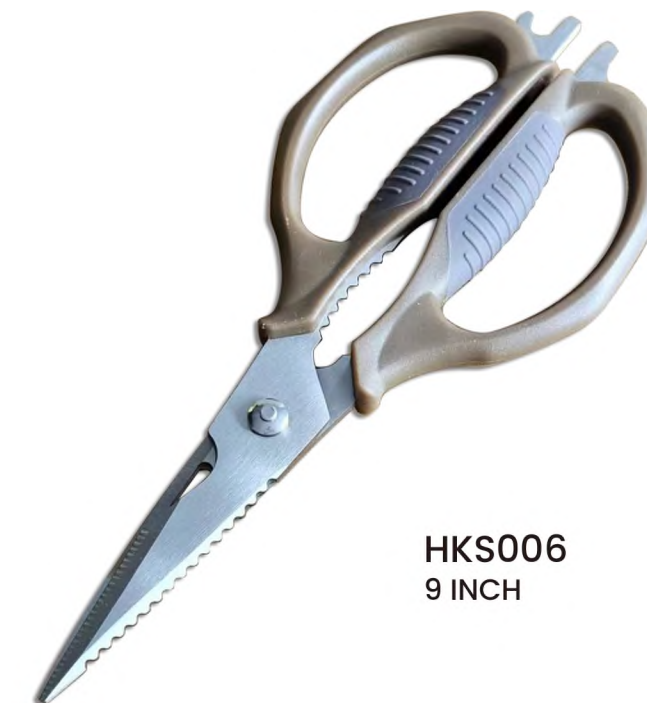
HKS006 9 INCH

*CNC Blade, Multifunctional item, detachable.