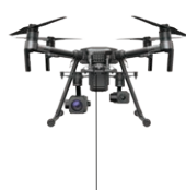
DJI M200 / M210