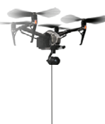
DJI Inspire 2