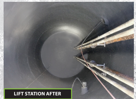
LIFT STATION AFTER

Our products are spray-applied, fast-curing, and H 2 S-chemical resistant.