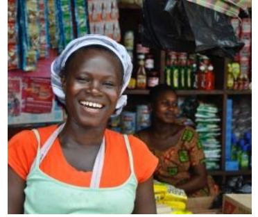
$$$ Strictly Ghanaian Cuisine Cooking Class (6 hrs) - Private