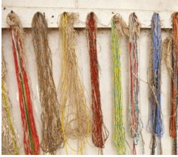
$$$ Cedi Bead Factory & Koforidua Beads Market