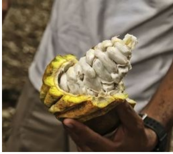
$$$ Journey Along the Cocoa Trail (7.5 hrs) - Private