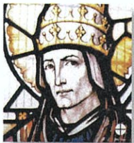
Saint Clement of Rome Feast Day: November 23

All are encouraged to wear their cultural attire for this Mass.