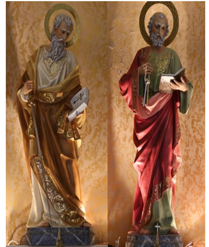
Prayer to Saint Peter

O Holy Apostle, because you are the Rock upon which the Almighty God has built His Church, obtain for me, I pray you, lively faith, firm hope and burning and love; complete detachment from myself, contempt of the world, patience in adversity, humility in prosperity, recollection in prayer purity of heart, a right intention in all my works, diligence in fulfilling the duties of my state of life, constancy in my resolutions, resignation to the will of God and perseverance in the grace of God even unto death, that so, by means of your intercession and your glorious merits, I may be made worthy to appear before the chief and eternal Shepherd of souls, Jesus-Christ, who with the Father and the Holy Spirit, lives and reigns forever. Amen