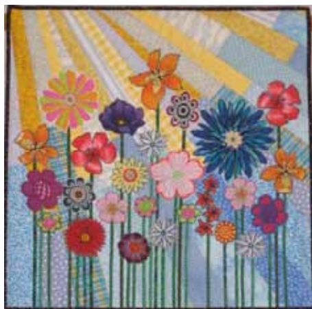
Quilted Collage by Tina Curran