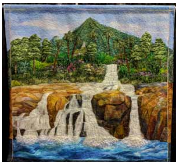
HIDDEN FALLS BY LINDA SCHMIDT