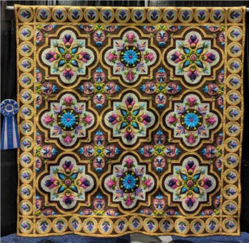
FIRST PLACE: MAJESTIC MOJAVE BY JOYCE PAYMENT