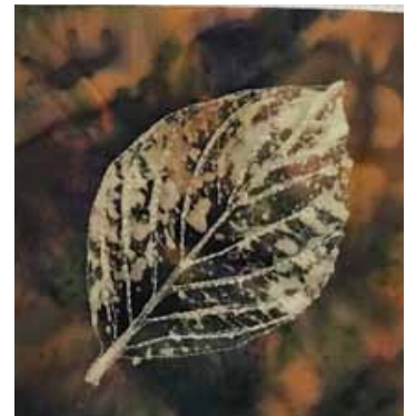
Discharge Fabric Art by Colleen Pelfrey