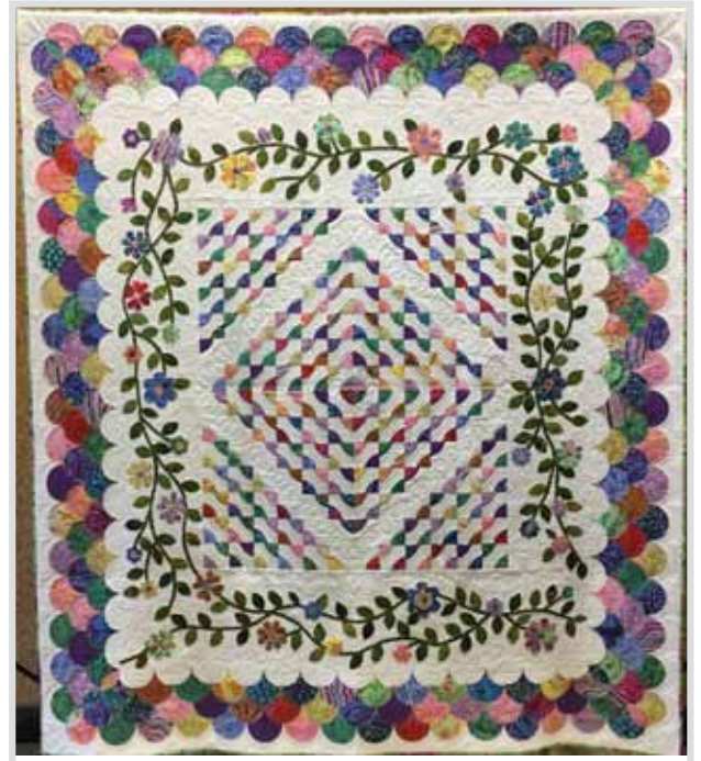
Drawing March 3, 2019 "Kaffe Clam Shell," Manteca Quilters Guild