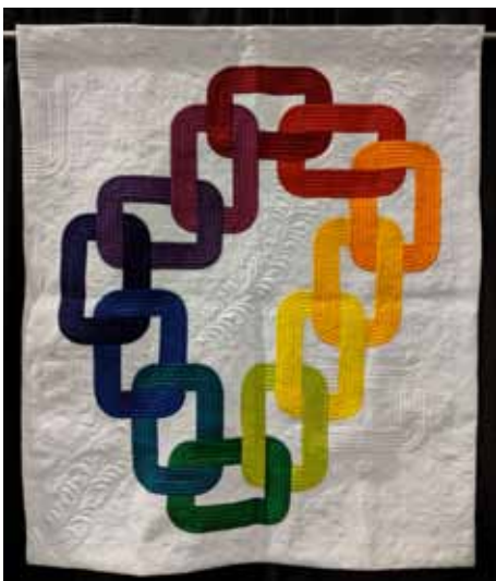
COLOR CHAINS BY ANITA HAY