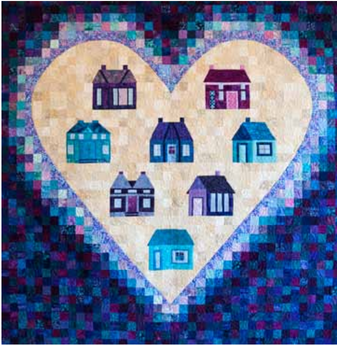
Drawing March 10, 2019 "Heart and Home 2," Yuba-Sutter Valley Quilt Guild

NCQC would love to have pictures of your Opportunity Quilts for our website. You can upload a photo online. We hope to promote Guilds and help you advertise your quilt shows. To see all quilts, go to www.ncqc.net/opportunity-quilts.html