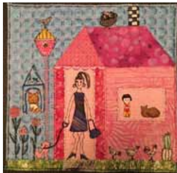
Drawing with Your Sewing Machine by Kathryn Pellman