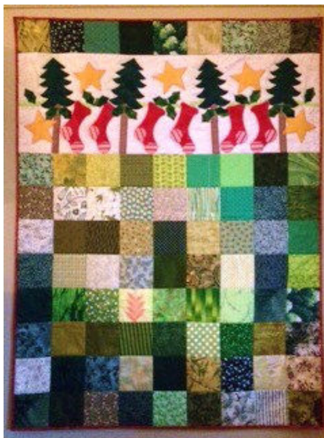
Quilter's Quest Shop Hop Quilt featured in the Quilted Heart Quilt Shop in Vacaville