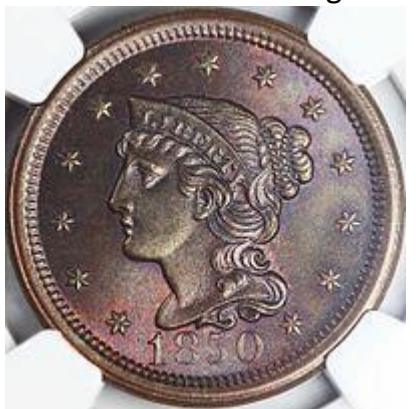
An 1850 Braided Hair cent Matron Head, or Middle Dates (1816–1839)

Coronet cents (1816–1857) Main article: Coronet large cent