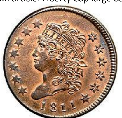
An 1811 Classic Head large cent

Liberty Cap cents (1793–1796) Main article: Liberty Cap large cent