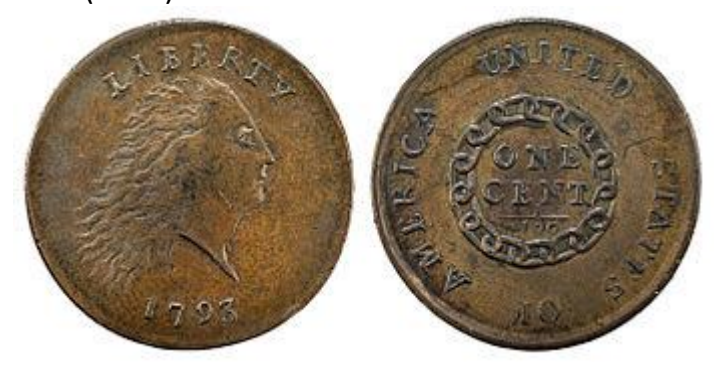
A 1793 Flowing Hair chain Cent

The Philadelphia Mint produced all large cents, which contained twice the copper of the half cent. This made the coins bulky and heavy, bigger than modern-day U.S. Quarters. Flowing Hair cents, chain reverse (1793)