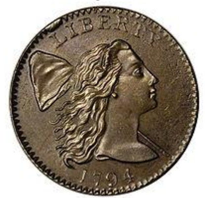
A 1794 large cent Main article: Chain cent

The obverse featured a bust of Liberty with a reverse of a ring of chains. Henry Voigt's design was almost universally criticized in its time for its unattractiveness and perceived allusion to slavery. It bears the distinction, however, of being the first official coinage minted by the United States federal government on its own equipment and premises. 36,103 were minted. Its low survival rate, in addition to its small mintage, coupled with being the first regular federal issue and a one-year design and type, has created an extremely strong demand from generations of numismatists. As a result, all surviving specimens command high prices ranging from $2,000-$3,000 in the absolute lowest state of preservation to over $500,000 in the highest.