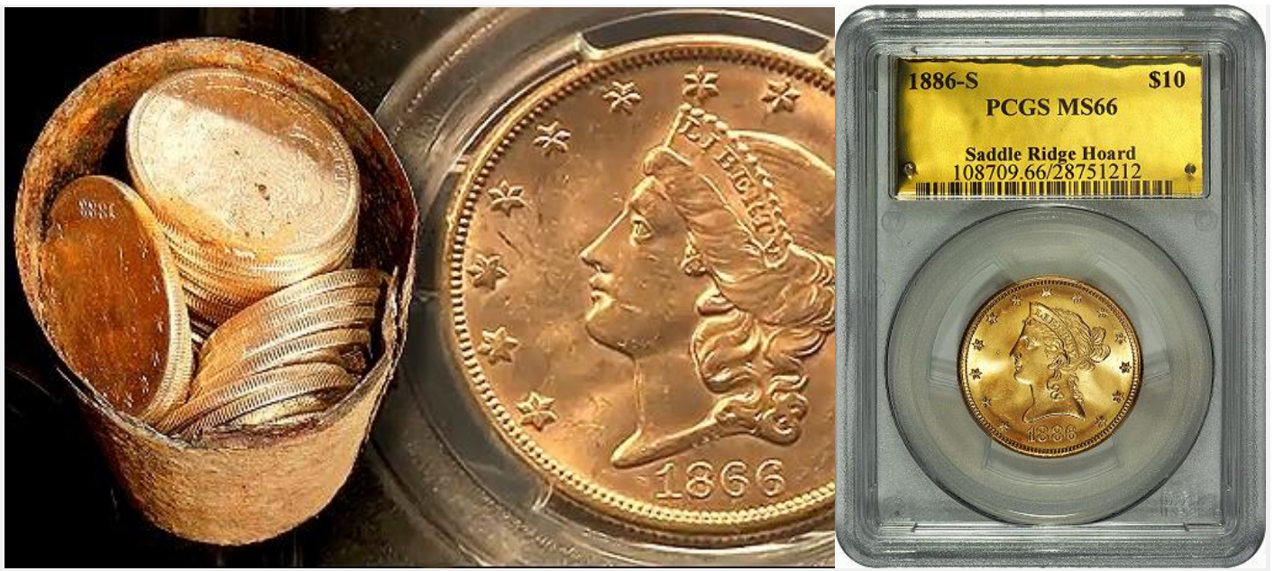
Gold coins found in the Saddle Ridge Hoard

The coins presented a numismatist's dream because it is very rare to find such a large cache of coins together all in one place. What's more, as we mentioned, the coins were immaculately preserved despite being, in some cases, over 150 years old.