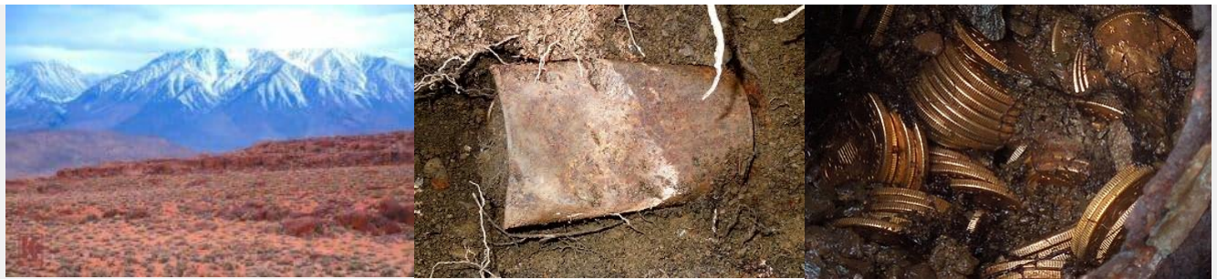
Sierra Madre Mountains