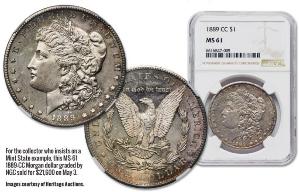
10 | August 21, 2023 | COINWORLD.com

Finally, the priciest examples in this category are MS-60 and MS-61 graded 1889-CC Morgan dollars, where there may be a surplus of marks and potentially dull luster, but no wear. These are the lowest Mint State grades on Sheldon's 1-70 scale, and Heritage's May 3 Platinum Night session featured an NGC-graded MS-61 coin that sold for $21,600. The catalog pointed out that Mint State survivors are elusive, and praised its strong strike and satiny, slightly reflective fields. It added, "Hints of russet-gold toning in the margins accent otherwise brilliant surfaces," recognizing, "Abrasions are light and unobtrusive." @