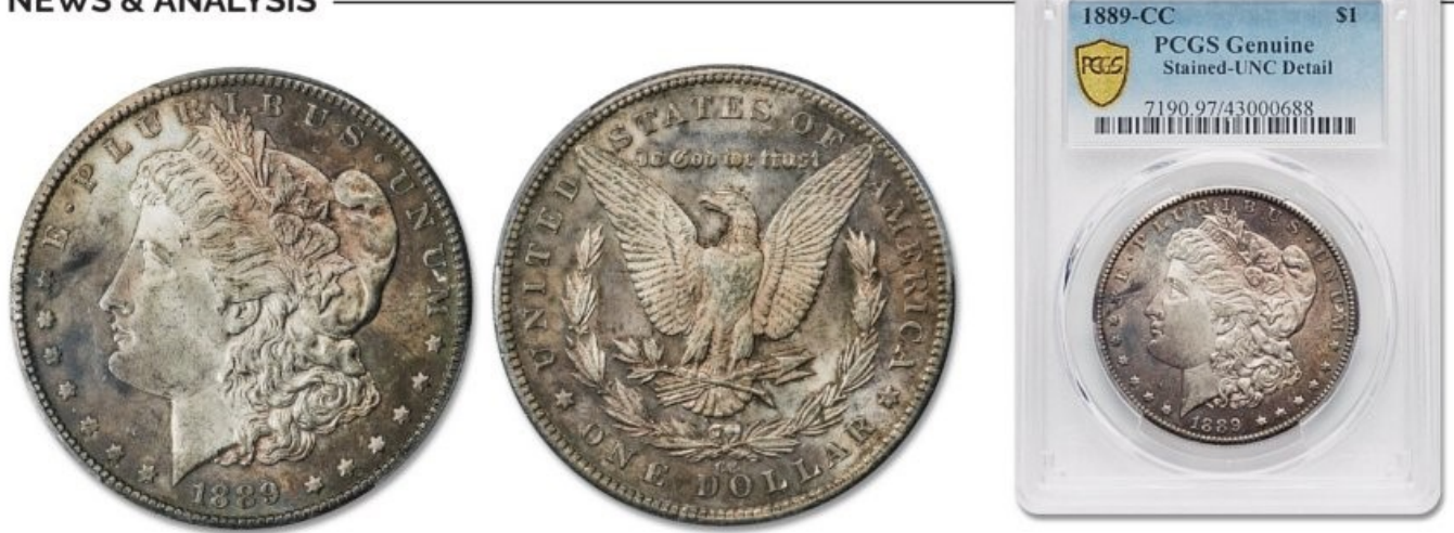
Graded Genuine, Uncirculated Details, Stained by PCGS, this lustrous and unworn 1889-CC Morgan dollar realized $16,800 on May 5.

AU or MS? from page 8 ers Galleries' June 13 Rarities Night auction, where the cataloger praised the outstanding eye appeal. The market seems to have preferred the prooflike and flashy look of this more expensive example.