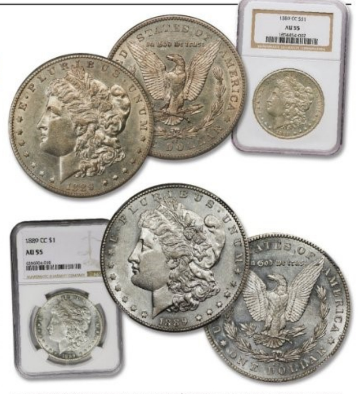
An AU-55 1889-CC Morgan dollar sold for $9,600 in May, while a similarly graded but flashier one sold for $14,400 the next month.

A May 5 Heritage auction offered an 1889-CC Morgan dollar graded AU-55 by Numismatic Guaranty Co. that realized $9,600. Wear is visible on its high points, including Liberty's hair, her cheek and the eagle's feathers, while some light rub in the fields impacts the luster.