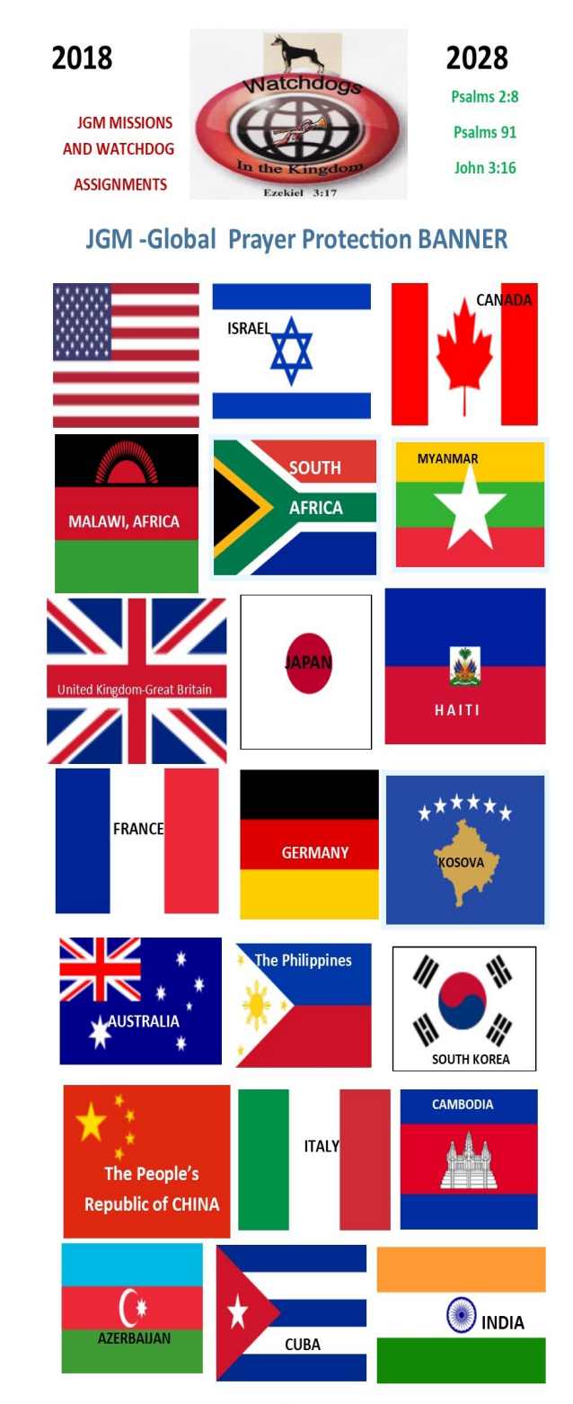
PRAY FOR ALL U.S. EMBASSIES & U.S. MILITARY AROUND THE WORLD