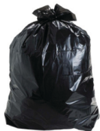
Extra large trash bags