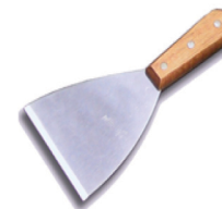
2 - Scrappers