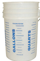
2- 10-20 qt. Measuring bucket