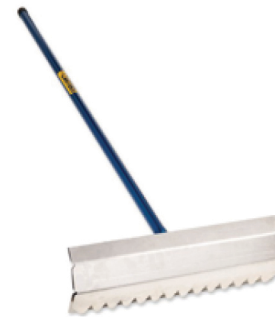
1 - Concrete rake