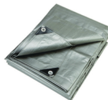
2 - Large Tarps