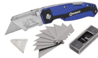
2 - Razor knives