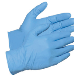
Box of XL rubber gloves