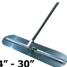
24" - 30" 1- Fresno Float