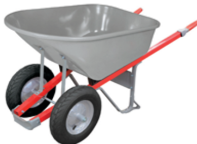
2 - Ex Large wheelbarrow