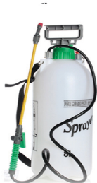
2 Garden sprayers 1 with water 1 with form release