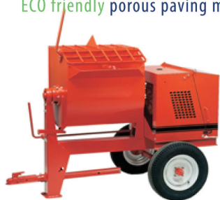
1- Paddle type 10 cu. ft. mortar mixer