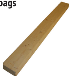
1 X 6 Screed board