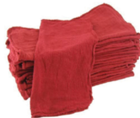
Bag of rags