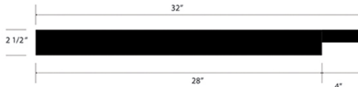
Spreading Tool - Fabricate from wood 1 x 3