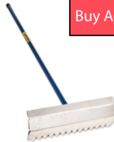
1 - Concrete rake

Handle Adpt - Kraft CC295 Float - Kraft CC618