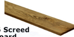
1 X 6 Screed Board