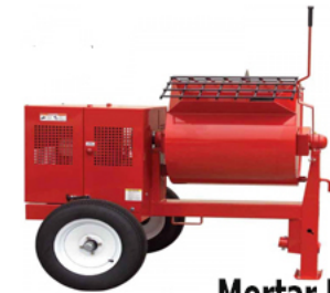
8-12 cu ft Mortar Mixer Paddle Type