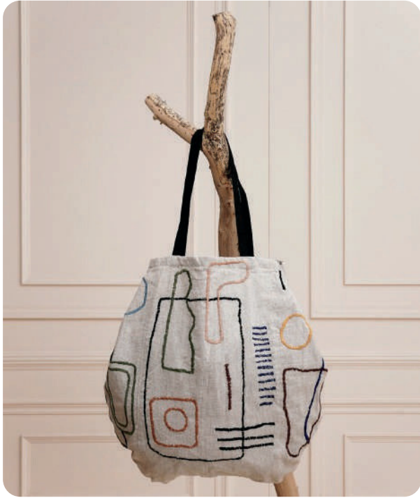
SKU -SILI05 24" x 24" Off white Handloom Tote bag, Hand crafted in satin stitch