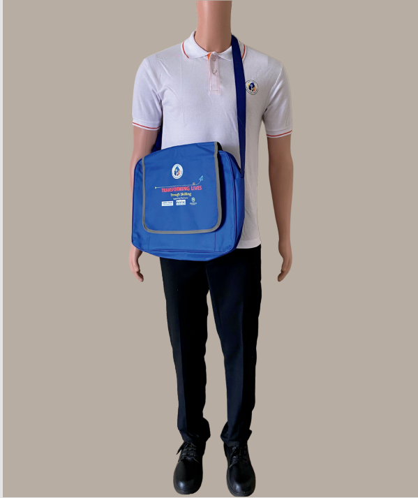
TB-001 ANTTC Trainee Bag