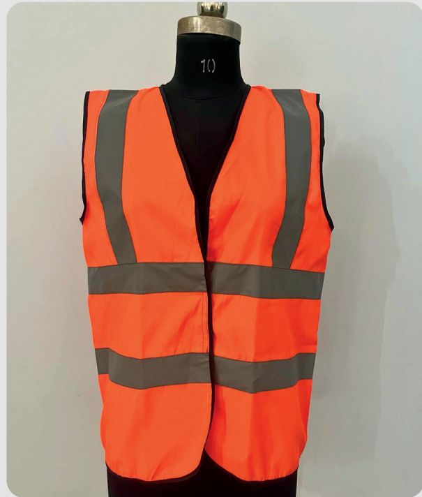
SSJM 002 Safety Jacket Model 2