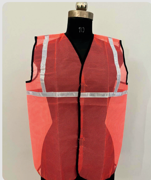
SJM 004 Safety Jacket Model 4