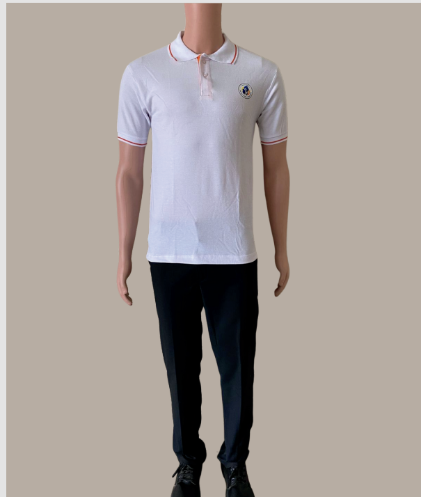
OFF 002 ANTTC T-shirt