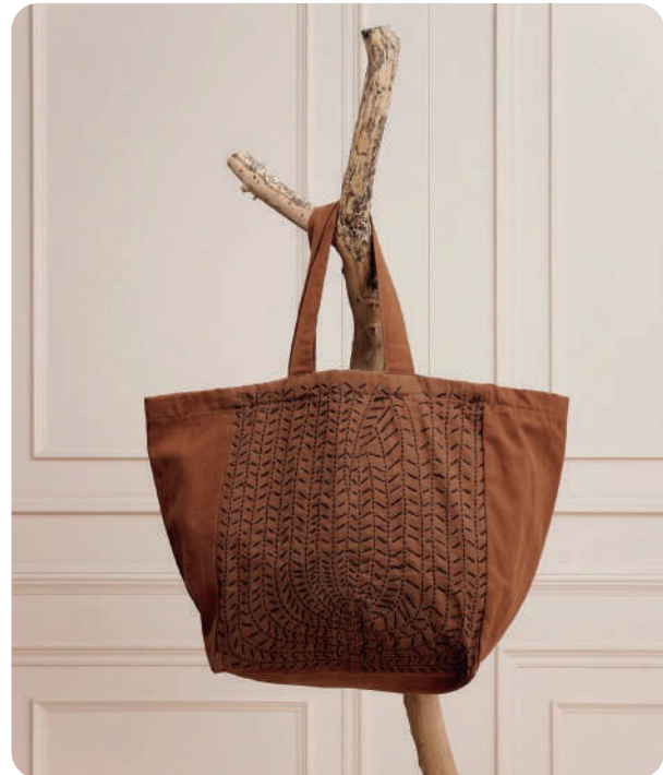
SKU - SILI08 13" x 14" x 9.5" Madder velvety denim tote bag, handcrafted in shashiko stitch