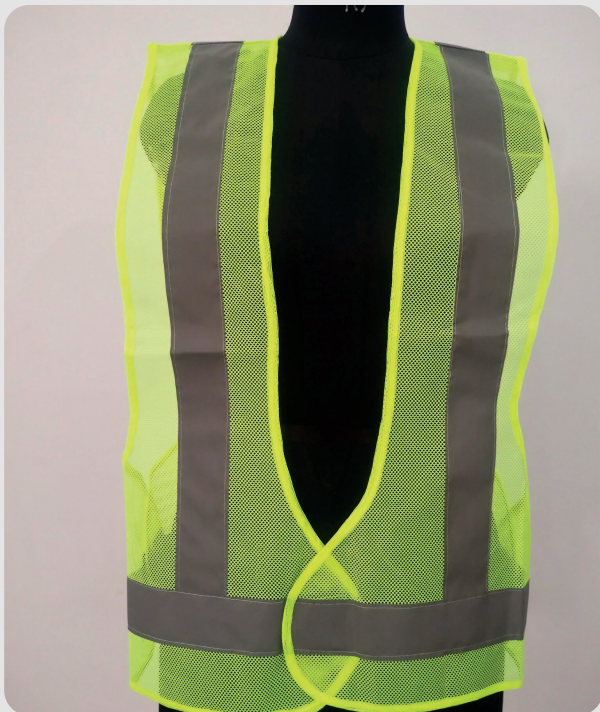
SJM 003 Safety Jacket Model 3