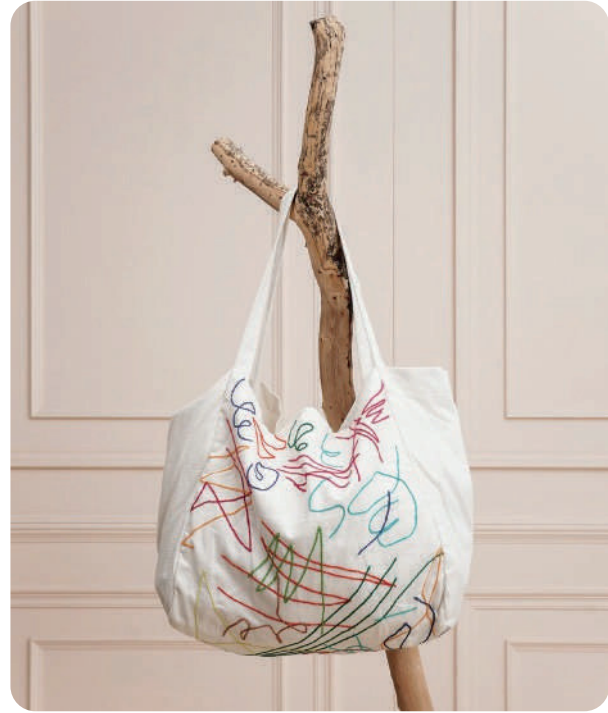
SKU - SILI06 15" x 14" x 10.5" Ivory White Casement tote bag, Handcrafted in chain stitch