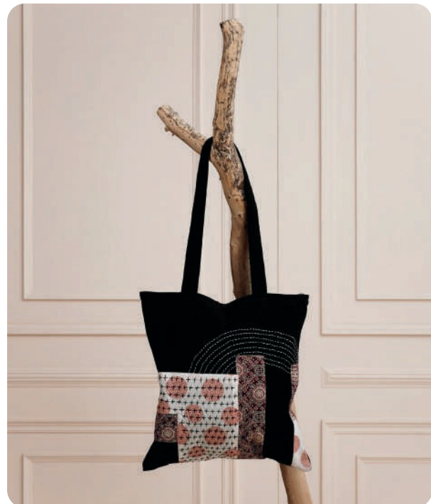
SKU - B-11 12" x 14" x 5.5" Black casement tote bag, hand crafted in shashiko stitch with Patch Price: