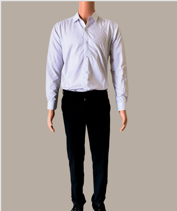
OFF 001 Office Wear