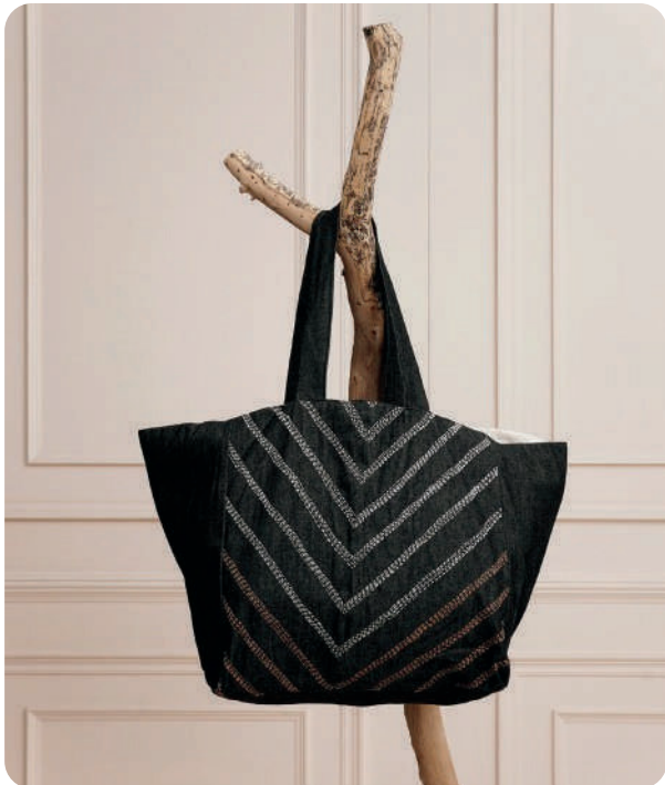
SKU - SILI07 13.5" x 12.5" x 10" Balck denim tote bag, handcrafted in shashiko stitch