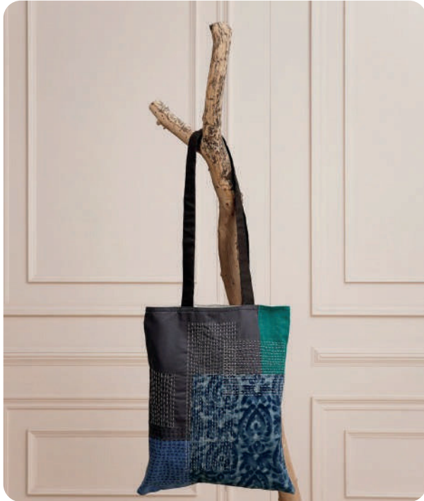
SKU - B-1 Grey Indigo casement tote bag, hand crafted in shashiko stitch with Patch Price: