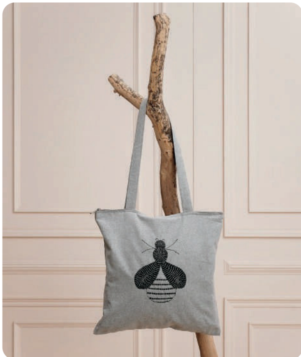
SKU - B-17.1 12" x 14" x 5.5" Grey casement tote bag with Bee hand embriodery in running stitch Price: