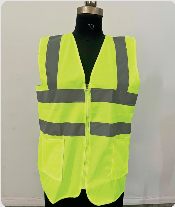
SJM 001 Safety Jacket Model 1