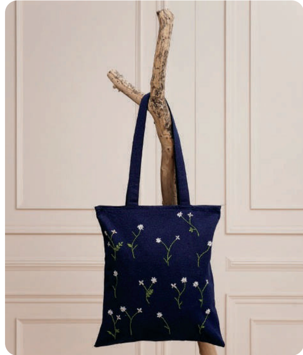
SKU - B-23 12" x 14" x 5.5" Indigo casement tote bag, hand crafted in lazy dazy stitch Price: