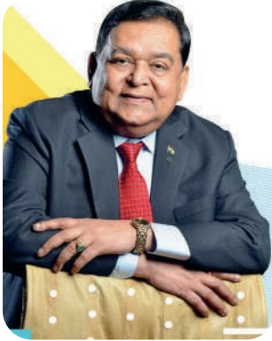
A M NAIK Padma Vibhushan Awardee & Philanthropist