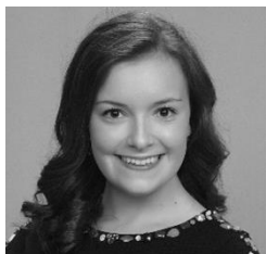
Founder and President