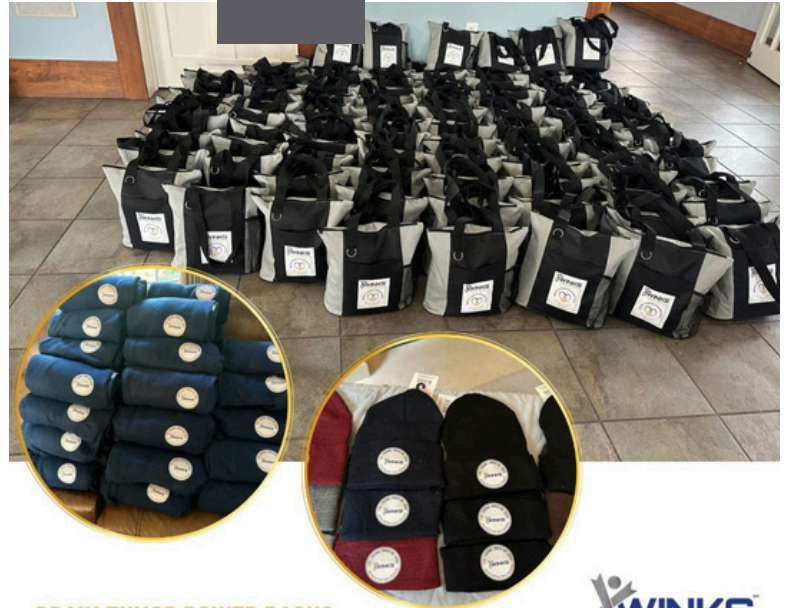
BRAIN TUMOR POWER PACKS