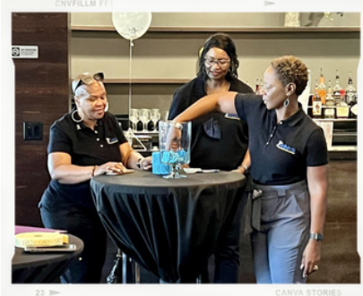
SILENT AUCTION & RAFFLE

dedicated Topgolf Bay in accordance with contest rules