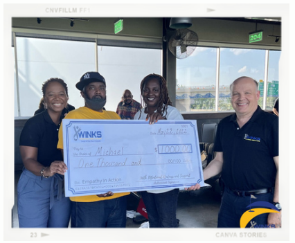
EMPATHY IN ACTION

Strengthen our connections Improve the quality of life for brain tumor patients and caregivers