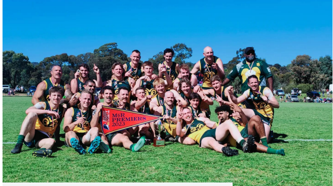
Senior Men B's - 2023 Premiers