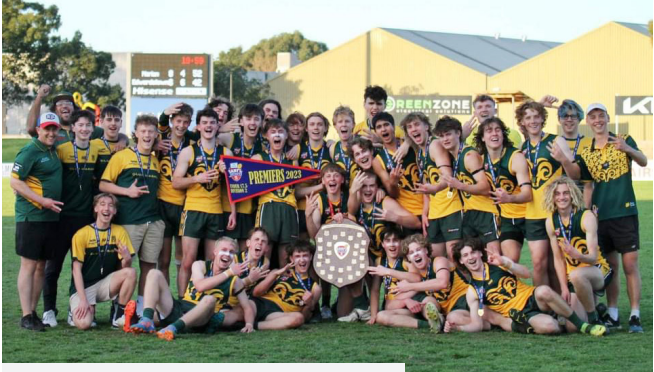
U17.5 Boys - 2023 Premiers

The Marion Football Club understands that in the current economic climate, organisations require value for any sponsorship money. Thus, the committee has put together a variety of sponsorship packages to provide local businesses and organisations a flexible opportunity to support their community.