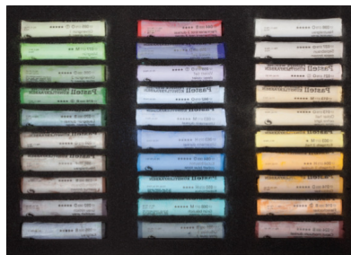
2. A good example of a balanced colour palette that includes brighter colours and some greyed out colours too. Pictured here is Schmincke 24 set.