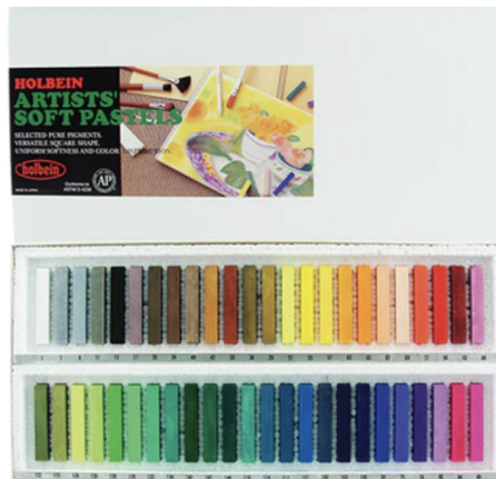
3. Faber Castell and Holbein kit that is mentioned above as “my recommended starter Kit” for those just beginning in pastel . Also sold as individual sticks.

My source for all my pastel supplies is www.wyndhamartsupplies.com in Guelph. They have lots of selection and ship materials.