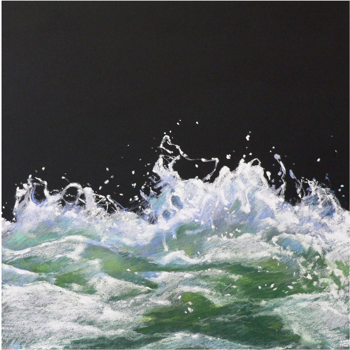
LIGHT GREEN WAVE MIXED MEDIA ON PANEL 21"H X 21"W (FRAMED IN BLACK) $1400