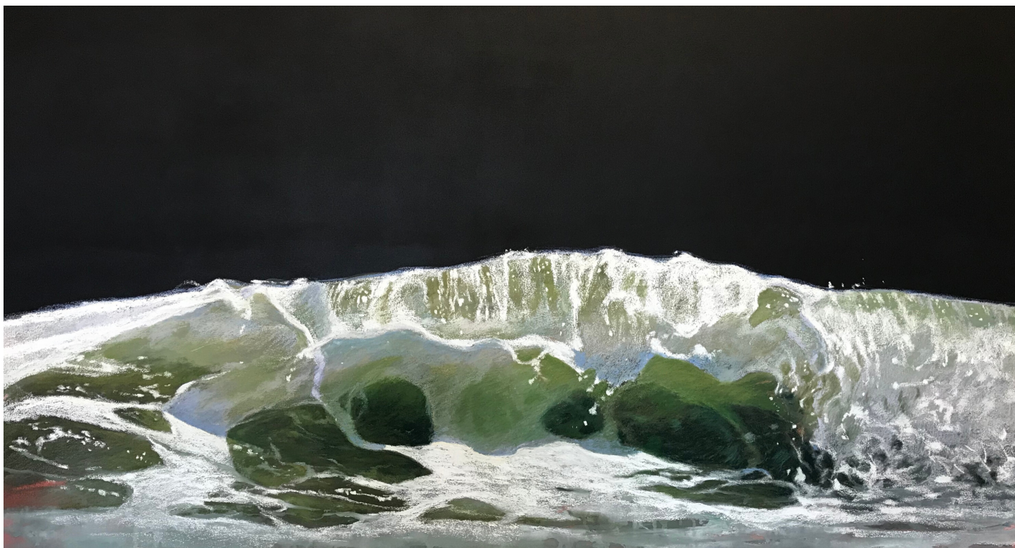
WAVE 2 MIXED MEDIA ON PANEL 26"H X 50"W, (FRAMED IN BLACK) $2800