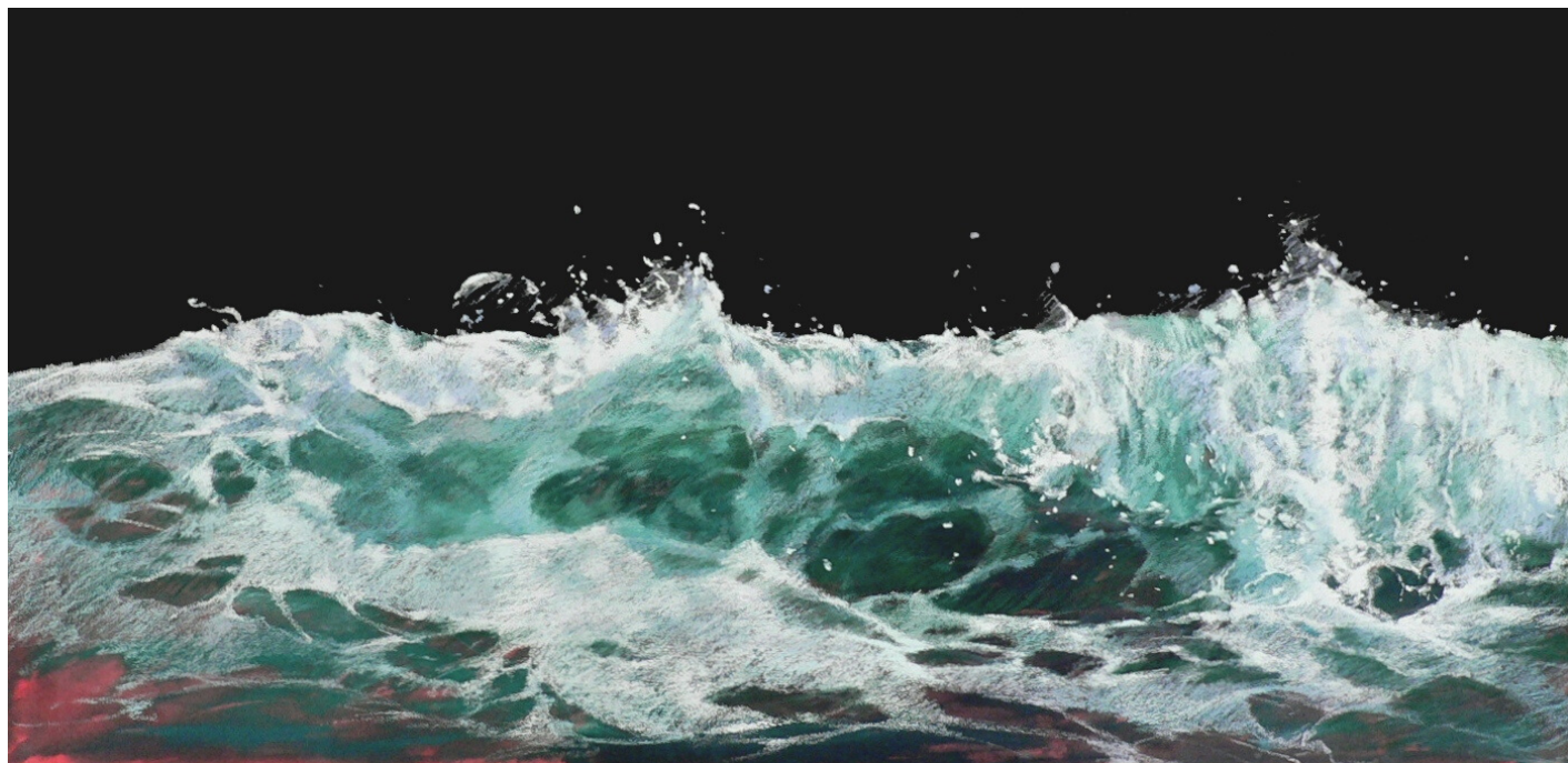
WAVE 3 MIXED MEDIA ON PANEL 22"H X 42"W (FRAMED IN BLACK) $2600