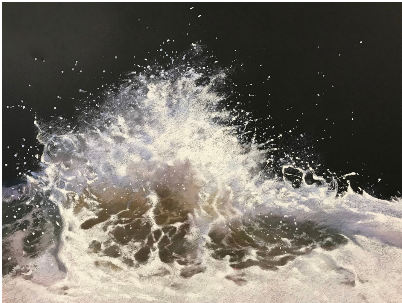
GEORGIAN WAVE III MIXED MEDIA ON PANEL 38"H X 50"W (FRAMED IN BLACK) TO BE DETERMINED