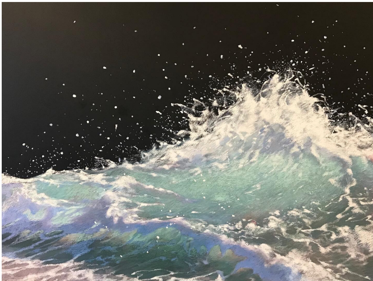
Turquoise Light Mixed media on panel 38"h x 50w" (Framed in black) $3400