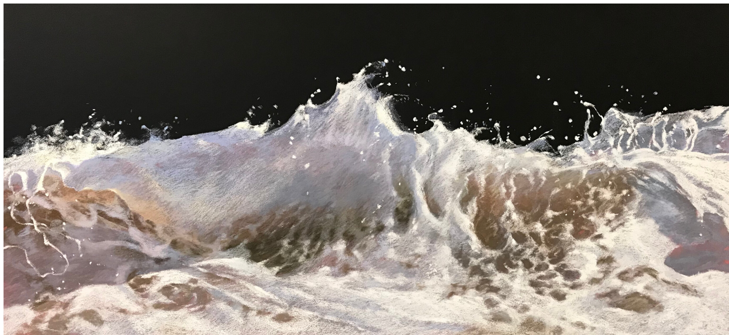
GEORGIAN WAVE I MIXED MEDIA ON PANEL 26"H X 50"W" (FRAMED IN BLACK) $2800