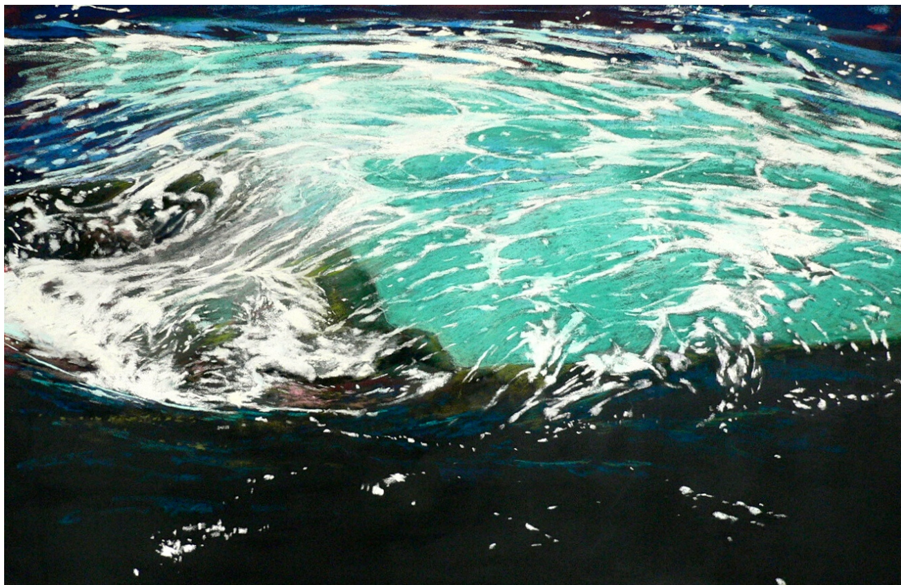
SPRING TIDE MIXED MEDIA ON PANEL 28"H X 42"W (FRAMED IN BLACK) $2800