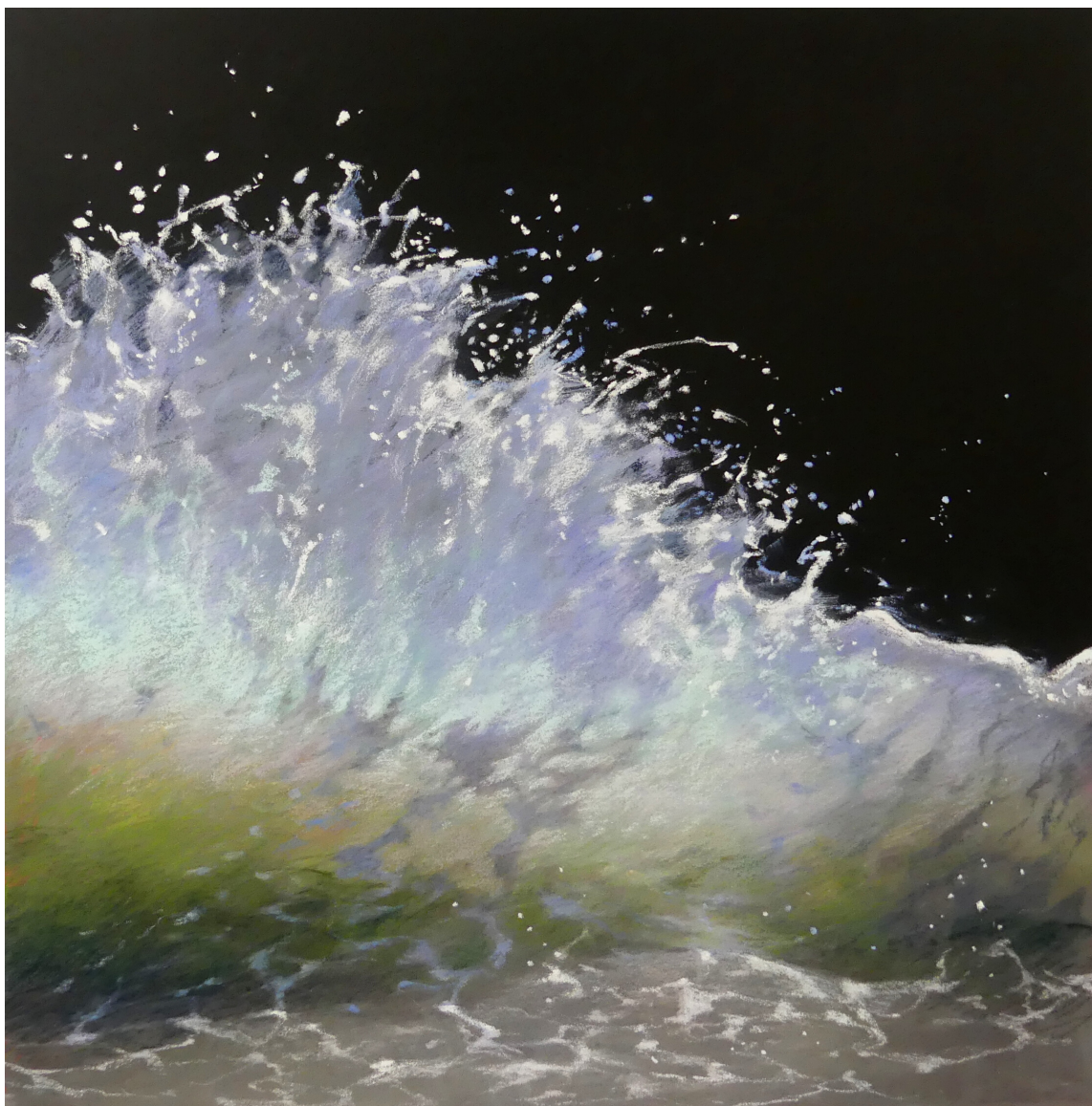
CRYSTAL WAVE MIXED MEDIA ON PANEL 30'H X 30"W (FRAMED IN BLACK) $2400