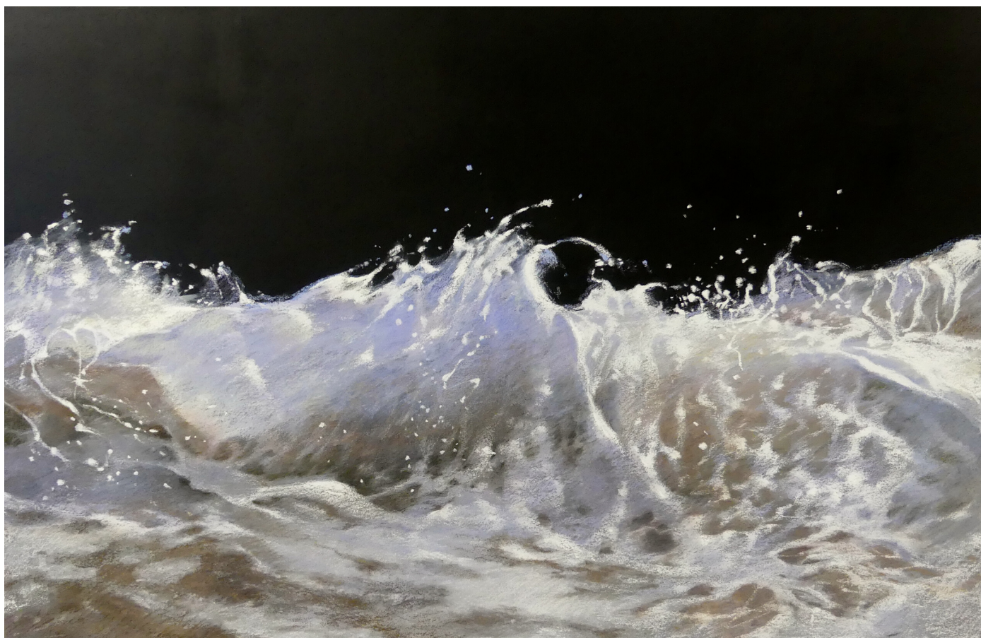
GEORGIAN WAVE II MIXED MEDIA ON PANEL 28'H X 42"W (FRAMED IN BLACK) $2800