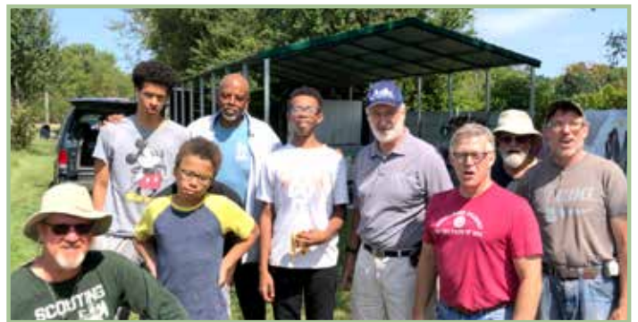
Grandfathers, Fathers, and sons laboring on the 3rd Saturday at SonShine Farms

If you, your company, or church would be interested in becoming share partners please visit our website SonShineFarmsTn.com or info@familyfoundationfund.org .