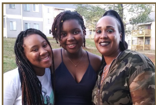
Crystal with her family