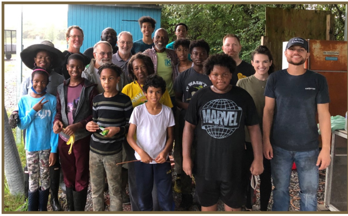
The FFF sons, farm crew, and the third Saturday family

5,500 pounds of delicious organic food in our Produce with a Purpose share boxes. Our partners were delighted and their employees grateful to receive the produce share boxes.